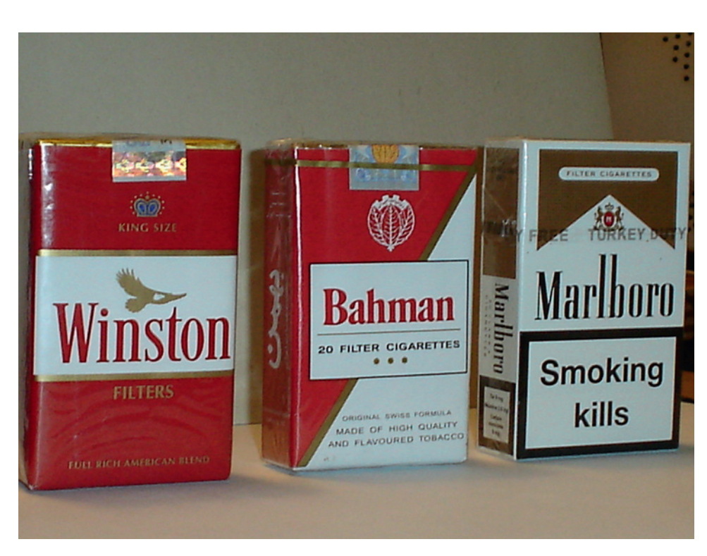
Figure 2 Brands of tobacco on sale in markets in Tehran.

In Tehran, foreign brands of cigarettes are in high demand, particularly by younger smokers. Many smuggled (illegal) versions of these brands are available. Unlike in other nations, smuggled brands in Iran are openly sold alongside legal, taxed brands (local and foreign) at newspaper stands and in supermarkets. This open sale of illegal cigarettes, for which no tax has