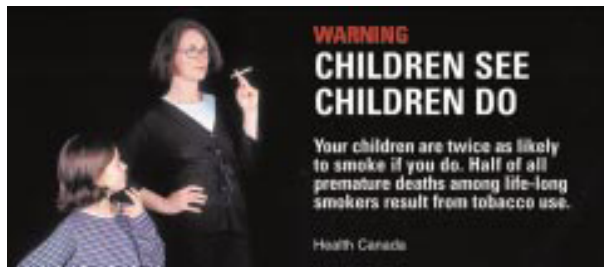
Figure 4 Canadian package warning label warning parents about their own smoking behaviour.

messages stressing the negative health consequences of smoking create fear among smokers, and that such messages may be more effective when presented in tandem with recommendations for how the negative consequences can be avoided. 6,26 Thus, labels that provide information about quitting could enhance the effectiveness of not only the current set of warning labels that focus exclusively on negative health consequences, but also future warning labels that would focus on enhancing people's efficacy to quit. For example, the new Canadian warning labels include quit tips, efficacy messages, and a website for obtaining additional information about methods of quitting.