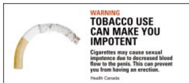
Figure 3 Canadian package warning label directed at young males.

The social psychological literature points out that it is important not only to identify which attitudes and beliefs are important for a given group, but also the underlying reasons for those attitudes and beliefs. 38 Research in this area focuses on the important question: what are the underlying functions for holding particular attitudes? Attitudes fulfil various functions, and understanding the function of the attitude provides insight into the types of messages likely to have impact. 39, 40