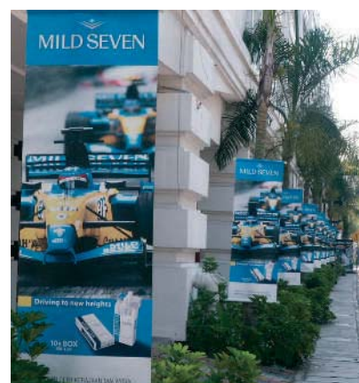
Saturation tobacco promotion was very much in evidence at the recent Formula One motor race in Malaysia.

Anyone who visited Malaysia in the 1980s and who turned on the television set in their hotel room was likely to see more tobacco promotion than they had ever seen before in a half hour of channel hopping. If they were there on public health business, they had an additional shock when they learned that the country had banned tobacco advertising on television. Ministry of health officials would announce this with sincerity, though some of them would admit that there were problems of circumvention. Did these stem from cross border television, which can be so troublesome to a tobacco control leader with less enlightened neighbours? No, the ads were on Malaysian TV, but were not for cigarettes at all, but for those well known but impossible to obtain products such as Marlboro and Kent holidays, or Camel clothing. In those days, no tobacco control advocate's conference presentation was complete without slides or video clips showing how tobacco companies were exploiting Malaysia and its innocent government.