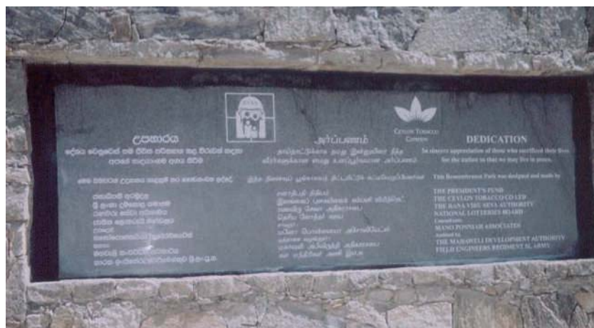
BAT’s golden tobacco leaf logo is prominently displayed on a stone memorial tablet in Sri Lanka’s National Remembrance Park.

CTC’s name and logo appear not only on signs leading visitors to and around the park, but prominently engraved for posterity on a stone memorial tablet at the solemn heart of the place, above the inscription: “In sincere appreciation of those who sacrificed their lives for our nation so that we may live in peace.”