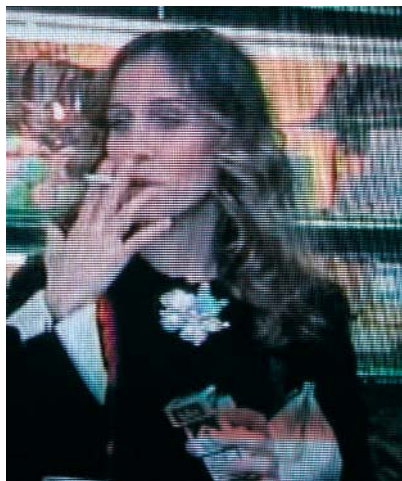
The “Sex and the City” season finale, in which the central character Carrie Bradshaw took up smoking again, appeared to glorify the activity.

In the case of “Sex and the City”, Ms Parker might have chatted with William B Davis, the “cigarette smoking man” of the wildly successful series, “The X-Files”. Davis, the arch villain of the series, was almost never seen without