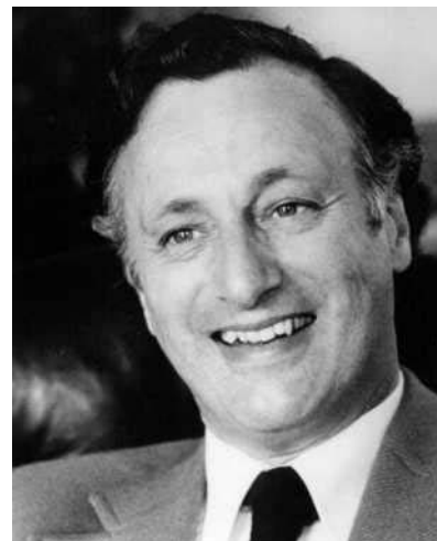
Actor Paul Eddington: an ASH supporter.

Eddington, a Quaker, had a long history of quiet involvement with important causes. When necessary, he was prepared to be a little less quiet, as when he publicly resigned in protest from the board of trustees of the Bristol Old Vic theatre company after it refused to end sponsorship from Wills Tobacco, which had a large factory in the city. He was a founder of a high profile group opposing tobacco sponsorship of the arts, and helped Action on Smoking and Health (ASH) on several occasions. Sadly, he did not live to see the UK’s ad ban—he died of a rare form of skin cancer in 1995—but he inspired and enlivened ASH’s work towards it.