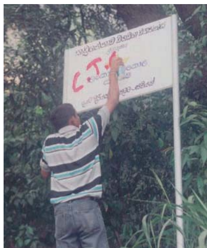
A young Sri Lankan protester "improving" one of the BAT sponsored signs in the Sri Lankan National Remembrance Park. The completed message read "CTC kills children".

Doubtless the BAT/CTC people responsible were sincere in their appreciation of the fallen, but a cynic might consider the irony that tobacco executives may hold a parallel, sincere appreciation of all those who are addicted to their company's products. These customers risk sacrificing their lives by the daily satisfaction of their addiction, in a commercial process encouraged by massive promotion, so that the executives and shareholders may live in greater personal, economic peace than might otherwise be likely.