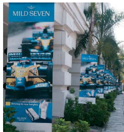
Saturation tobacco promotion was very much in evidence at the recent Formula One motor race in Malaysia.

Anyone who visited Malaysia in the 1980s and who turned on the television set in their hotel room was likely to see more tobacco promotion than they had ever seen before in a half hour of channel hopping. If they were there on public health business, they had an additional shock when they learned that the country had banned tobacco advertising on television. Ministry of health officials would announce this with sincerity, though some of them would admit that there were problems of circumvention. Did these stem from cross border television, which can be so troublesome to a tobacco control leader with less enlightened neighbours? No, the ads were on Malaysian TV, but were not for cigarettes at all, but for those well known but impossible to obtain products such as Marlboro and Kent holidays, or Camel clothing. In those days, no tobacco control advocate's conference presentation was complete without slides or video clips showing how tobacco companies were exploiting Malaysia and its innocent government.