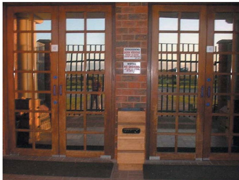
Entrance to the Mossel Bay Magistrates Court in South Africa, where smoking is now banned, with a sign saying in both official languages "No smoking within 10 metres of entrance".

solution was to make the court entirely smoke-free; and by 2003, it was. Court security personnel were instructed to order anyone smoking to either leave the building or extinguish their cigarettes immediately. Interestingly, some of the worst offenders and the last to hold out were police and court employees. With the interior now smoke-free, the smokers predictably gathered at the entrance, forming a smoky cloud through which non-smokers had to battle as they went in or out. At last, a senior magistrate decided that enough was enough, and agreed to the court displaying signs in both official