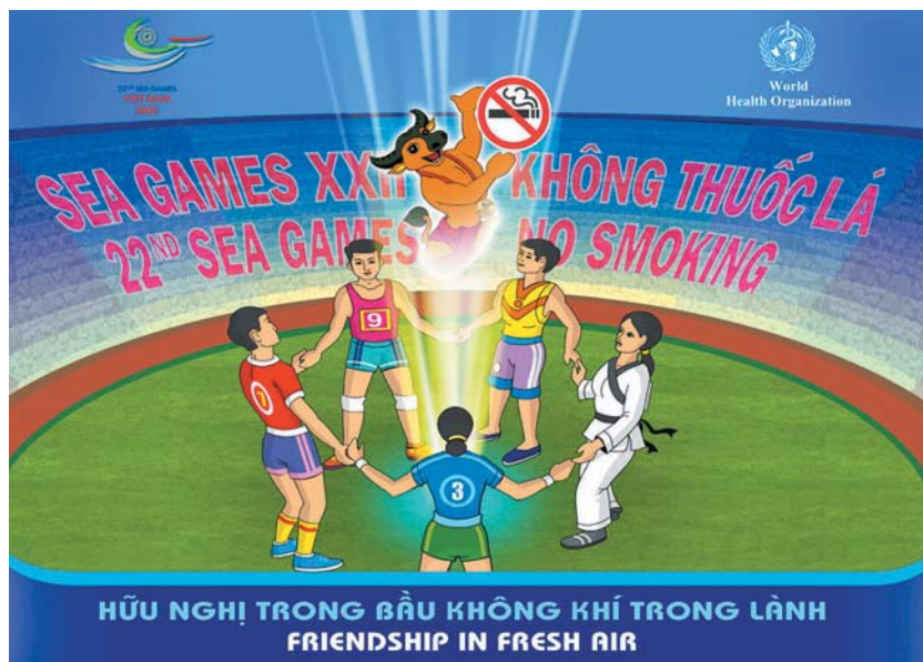
Poster promoting the first ever smoke-free South-East Asia games.

the exercise had also produced wider gains for public health. It reinforced existing tobacco control policies and put tobacco firmly on the agenda, not just in Vietnam, but in all 11 participating countries, whose ministers of health all received detailed information about it. Health officials spoke of excellent inter-agency cooperation and support, and significantly increased knowledge and awareness of the health effects of smoking over a wide ranging population. WHO provided some US$30 500 for the implementation of the policy, making its success seem exceptional value for money, and enabling Vietnam to provide a valuable lead for others to follow.