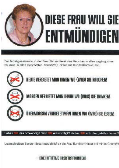
Austrian health minister, Maria Rauch-Kallat, appears in a leaflet distributed by the country's tobaccoists proclaiming "This woman will take away your rights".

There have been exceptions, though. In 1980, a burst of enthusiasm by a