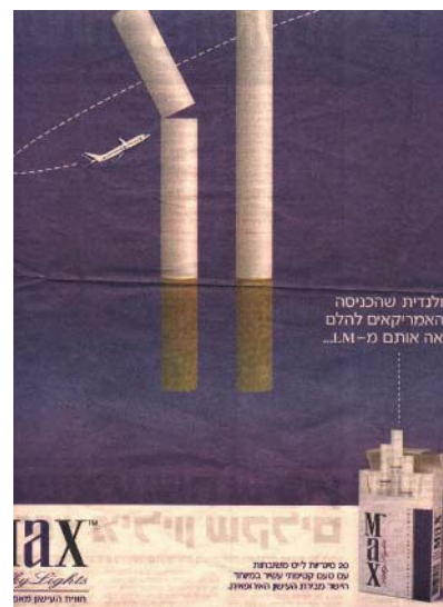
Israel: the owner of the advertising agency that produced this provocative ad for Dutch manufactured Max cigarettes said there were "almost no holy cows" when using controversial images. The ad, which appeared last November, was designed to capture market share from US made L&M brand. The caption translates as, "The Dutch one that shocked the Americans and took them out of L&M"; a slang pronunciation of the Hebrew word for shock sounds like L&M.

Last year, another health minister had a go. Maria Rauch-Kallat, a teacher by profession, announced a package of measures on smoking in public places. Compared to other EU countries, not only is it modest, but it is questionable whether it is even up to minimum EU requirements. Worst of all, implementation relies in the early years on that long discredited, tobacco friendly mechanism, "voluntary agreement", though with the option for the minister to step in with legislation later. But judging by the uproar that ensued, she might as