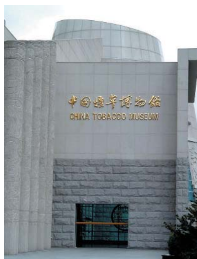
Entrance to the China Tobacco Museum, recently inaugurated in Shanghai City.