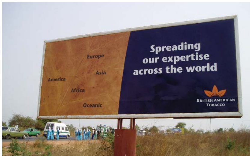
Gambia: BAT's boasts British American Tobacco's public relations advertisements hold a second, sinister meaning for African tobacco control advocates trying to prevent increasing recruitment to smoking in some of the world's poorest countries.