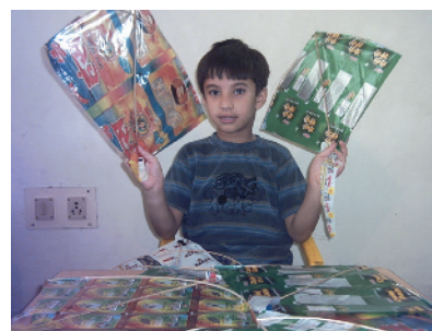
Manufacturers of oral tobacco products in India have taken to using kites as a marketing tool—one that is particular attractive to children.

Despite tobacco advertising having been completely banned in India for more than two years, manufacturers of oral