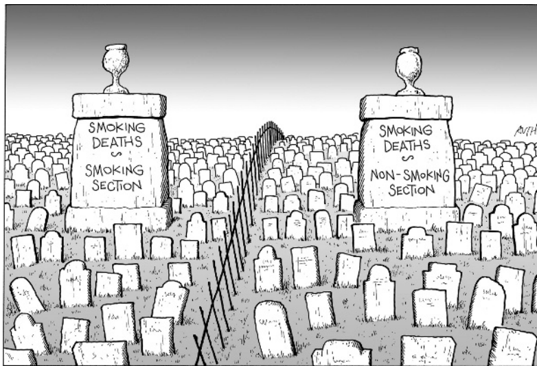
© 2006 The Philadelphia Inquirer. HUMOROUS ARTS, PHILADELPHIA

Tony Auth © 2006 The Philadelphia Inquirer.