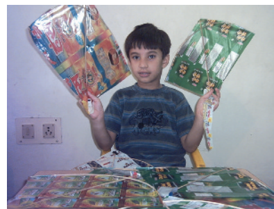
Manufacturers of oral tobacco products in India have taken to using kites as a marketing tool—one that is particularly attractive to children.

Despite tobacco advertising having been completely banned in India for more than two years, manufacturers of oral