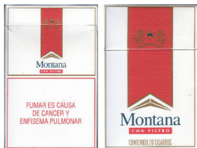
Health warning labels on a pack of cigarettes marketed in Mexico, where the larger warnings are restricted to the back of the pack (left). Images or pictures have been specifically precluded from the front of the pack (right).

the size of the three current health warning labels (“Smoking causes cancer and pulmonary emphysema”, “Smoking during pregnancy increases the risk of preterm delivery and low birth weight of newborn”, and “Stopping smoking reduces important health risks”) from 25% to 50% of the back face of the cigarette packages. The total size actually pertains to the frame that delimits the label, and not the label itself. The agreement avoids stronger and more effective pictorial labels on the front of the packages as recommended by the FCTC. In fact, it explicitly precludes “images or pictures”.