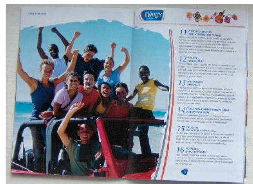
Billboard and magazine insert advertisements for “Wings by Winston”, introduced by Japan Tobacco International, which overtly target the youth market in Russia.