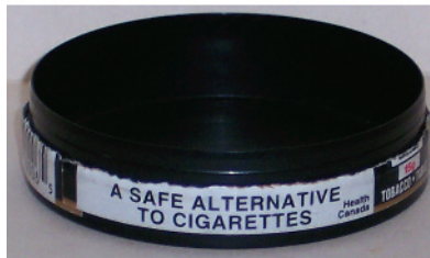
Canada: now you see it, now you don't Intention or chance? The apportionment of the health warning text on this oral snuff container, and of the French language version on the other side, creates a serious flaw when the lid is removed.

and the USA more than a quarter of a century ago, and it seemed reasonable to hope that they would not be seen in the 21st century. Of course, it is just possible that the new brand could be significantly different, but it would take a long time for a properly designed trial to prove it. It is to be hoped that the Indian government steps in to investigate and, at the very least, regulate it properly.