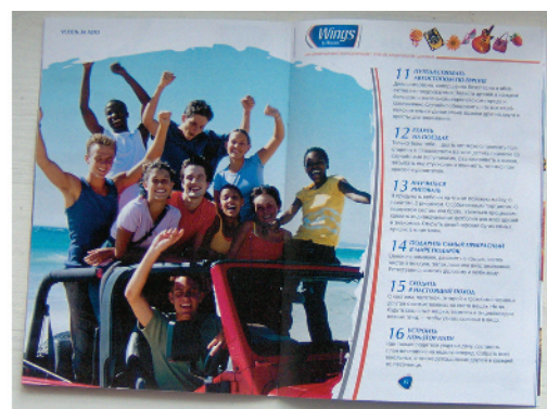
Billboard and magazine insert advertisements for "Wings by Winston", introduced by Japan Tobacco International, which overtly target the youth market in Russia.