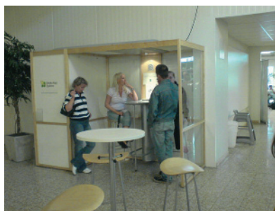
A smoking booth at Sweden's Skavsta airport.

Sweden's well deserved reputation for good design and technology, earned by