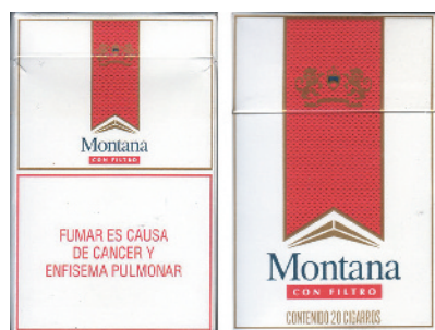
Health warning labels on a pack of cigarettes marketed in Mexico, where the larger warnings are restricted to the back of the pack (left). Images or pictures have been specifically precluded from the front of the pack (right).

the size of the three current health warning labels (“Smoking causes cancer and pulmonary emphysema”, “Smoking during pregnancy increases the risk of preterm delivery and low birth weight of newborn”, and “Stopping smoking reduces important health risks”) from 25% to 50% of the back face of the cigarette packages. The total size actually pertains to the frame that delimits the label, and not the label itself. The agreement avoids stronger and more effective pictorial labels on the front of the packages as recommended by the FCTC. In fact, it explicitly precludes “images or pictures”.