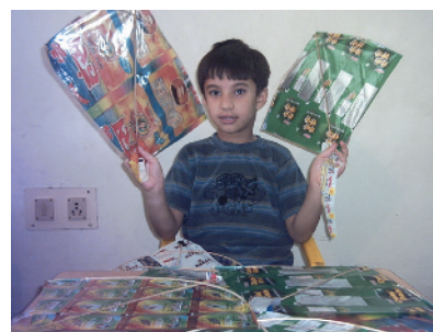
Manufacturers of oral tobacco products in India have taken to using kites as a marketing tool—one that is particularly attractive to children.

Despite tobacco advertising having been completely banned in India for more than two years, manufacturers of oral