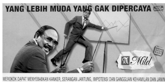
Figure 3 A Mild advert "The younger generation that is not trusted".

Project QTI researchers are currently in the process of developing and testing counter-advertising messages that popularise a non-smoking identity. Two coextensive cultural themes that are being developed for use include: (1) willpower as a virtue associated with masculinity and (2) family responsibility as a value that eclipses personal pleasure. Both of these themes tap into Javanese images of strength and moral identity. Challenging one's self to overcome hunger, thirst and even sleep is respected in Javanese culture. An association of strength with willpower and moderation is well articulated during Ramadan, a time when inner strength and control of one's desires is valorised. During the fasting month, one must abstain from eating all day and, when breaking one's fast, also exercise control to not indulge in the overconsumption of food.