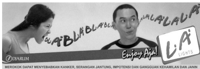
Figure 1 Billboard for LA Lights.

classy breed” that the cigarette holds as its promise. Adverts for other youth brands, such as LA Lights, commonly feature a lineup of cosmopolitan males and females dressed provocatively. In this context of youth sociality, women appear to be lending approval to smoking as a behaviour one engages in to have fun. In interviews and focus groups, informants noted that young women who smoke tend to prefer A Mild, LA Menthol Lights and Marlboro Lights. Of the three, the former two include women in their adverts. In 2008, two new slim cigarettes (Djarum Black Slims and Surya Slims) were introduced into the market. The billboards and banners that line the streets do not have a photo, but rather feature the slim sleek package. Although women are not visibly connected to these new product lines, slims are typically the domain of women.