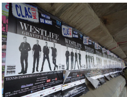
Indonesia: posters promoting a concert to be given by Irish ‘boy band’ Westlife, sponsored by Clas Mild cigarettes.

Perhaps Neon Trees were taking their cue from US band Maroon 5, which was scheduled to perform in Indonesia for the kretek brand Surya Pro Mild in April. The band’s management responded swiftly to an online campaign, asking the band to drop the sponsor. They also announced that they would make a substantial donation to a local cancer charity. However, by the end of the year there had been no confirmation that the donation was received, and even after the tobacco branding for the sold-out concert was dropped, a Facebook competition for tickets continued to run, allowing the tobacco company to gather the personal details of thousands of fans.