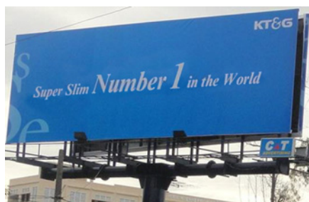
Cambodia: a KT&G Esse brand billboard after the advertising ban.

As Australia’s plain packaging bill passed into law after weathering long and hard storms of tobacco industry opposition, health advocates and pro-health politicians applauded the courage and determination of the two women responsible: health minister Nicola Roxon and prime minister Julia Gillard. An early female leader in the same region, Helen Clarke, then health minister and later prime minister of New Zealand, was responsible