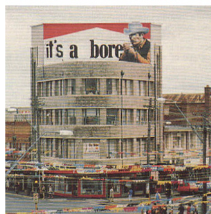
Australia: citizens' action 'improved' tobacco billboards such as this iconic Marlboro billboard in Sydney, seen before and after treatment, in the early days of tobacco control.

reporting improvements. As Tobacco Control moves forward into its second 20 years, readers are urged to keep helping us to place on record the best—and the worst—news as they witness it. Their experiences can equip, inspire and embolden others still struggling to achieve similar aims. To educate a recalcitrant health minister, say, or to encourage a keen one battling to obtain tougher action, there is nothing like a published piece in a prestigious international journal to show what is taking place elsewhere. We look forward to continuing to report news from every corner of the world, until the tobacco pandemic exists only as part of history.