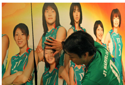
Japan: a poster being put up to promote the World Cup volleyball tournament, showing female players wearing JTI clothing.

Last November, JTI earned the unusual dishonour of being criticised by name by the WHO after the Japanese national