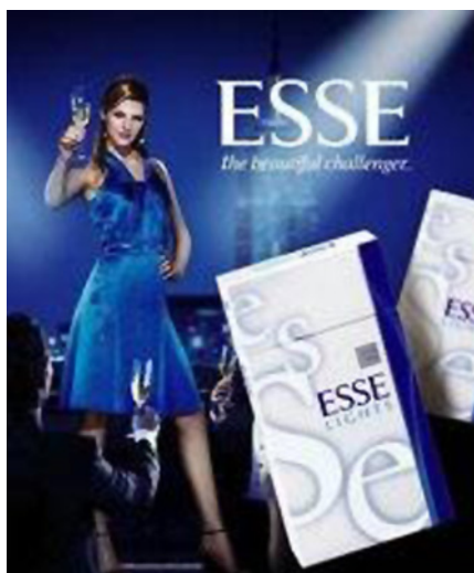
Cambodia: an Esse ad on Facebook.

In July last year KT&G further strengthened its foothold in Asia by buying a controlling share of Indonesia’s sixth largest tobacco company, PT Trisakti Purwosari Makmur, which sold some 3 billion sticks in 2010. This latest acquisition was the company’s third in 6 years in Indonesia, one of the world’s largest tobacco markets, with 57 million smokers comprised mainly of low income and young people. Esse advertisements were soon lining the streets of Jakarta, and to reach out to internet savvy young people, a Facebook account was also set up, Esse Indo. Promotions in Indonesia can be expected to intensify as tobacco companies compete to recruit more young women and girls. The Indonesian government has