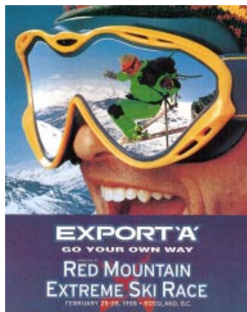
Figure 3 Sport and brand reflecting identity.

to the image. Expensive sport sunglasses are a much prized symbol of status among the young. Their mirrored surfaces add an element of ambiguity and mystery that more readily permits viewers to project themselves into the scene and identify with the image. Perhaps most importantly, digital image manipulation allows the visual to simulate how people are reflected in the mirrored lenses. This resonates with the concerns of the young as to how they will appear to their peers.