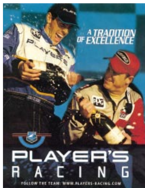
Figure 2 Racing hero enjoys enviable success.

The portrayals of the extremely risky sports in recent Export “A” ads have many consistencies, such as the extreme close up on the head of the solo athlete shown, who wears mirrored sunglasses reflecting their sport (fig 3). The sunglasses add several interesting dimensions