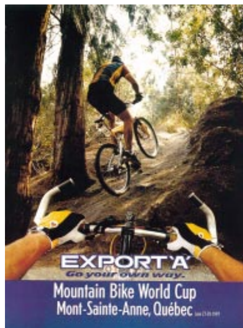
Figure 4 Solo mountain bike racing.

No matter how attractive these ads may make smoking appear, their benefit to this brand and this firm is made uncertain for at least two primary reasons. The first lies in the use of pictures of health using emergent contemporary recreations in pure and pristine environments that echos those long used by Player's, even given their current shift of focus to auto racing. Thus, Export "A" is adopting a "me too" positioning, known to be a difficult task. By imitating and extending that which has been so successful for Player's, they risk falling into the perceptual shadow of Player's brand image, with some viewers confusing their effort