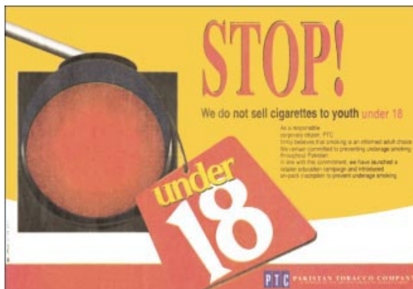
The "Stop!" advertising campaign being run by the Pakistan Tobacco Company (a subsidiary of BAT), declaring that "As a responsible corporate citizen, PTC firmly believes that smoking is an informed adult choice".

Lest any of this excess should nudge the government into thinking about legislation, the leading companies, BAT and Lakson, have produced their own self regulatory code of conduct on tobacco promotion and sales. Predictably, it is a compilation of the most ineffective measures developed over years of successful efforts to prevent or delay legislation in the west. Ensuring maximum effects on both opinion leaders and children, BAT has added the usual advertising campaign proclaiming its youth education programme, complete with repeated emphasis on the belief of this "responsible corporate citizen" that smoking is "an informed adult choice". It has even introduced "on-pack inscriptions" to prevent under-age smoking". This will be a great relief to Pakistani parents. No doubt any errant child who foolishly picks up a pack of cigarettes made by