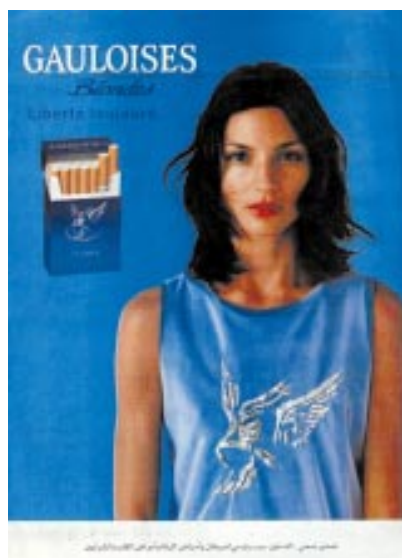
Gauloises advertisement now appearing in Middle Eastern countries, carrying the slogan "Liberté Toujours" (Always Freedom).

and attended a briefing the following week. Several were not regular smokers, but £50 for simply "dressing glamorous" and mingling, being charming, buying drinks, offering cigarettes, and above all, smoking, seemed too good to resist. If appropriate, they were told, they could offer whole packs of cigarettes, and leave them lying around on unoccupied tables. The priority, it was made clear, was that Gauloises should be associated with youth and glamour.