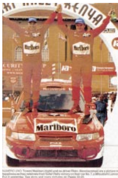
Motor sports, such as the Kenyan Safari Rally, still provide massive publicity for tobacco companies such as Philip Morris (Marlboro), who took over sponsorship of the rally from BAT (555).