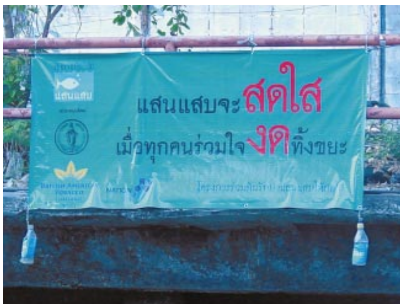
Billboard alongside the Saen Saeb canal in Bangkok, featuring the British American Tobacco logo. Although BAT were the main sponsors of the Keep Saen Saeb Canal Clean Project, the company's funding was described by one Thai health official as "this blood-stained donation to charity", and the publicity was promptly stopped.

More news from Germany, tobacco rent-a-nation of the European Union (EU), where the fight by industry interests against relatively small health forces continues to produce some extraordinary anomalies in a country so long at the forefront of technological progress. In December,