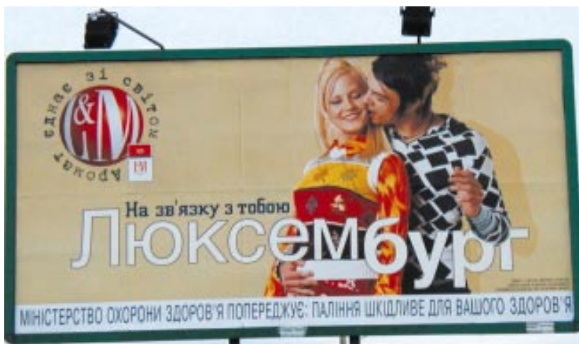
Ukrainian advertisement for the Philip Morris brand L&M, seemingly encouraging smoking during pregnancy.

All these culminated in the Keep Saen Saeb Canal Clean Project, created