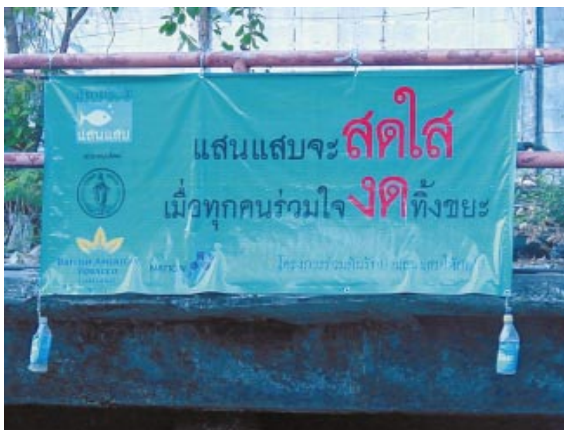
Billboard alongside the Saen Saeb canal in Bangkok, featuring the British American Tobacco logo. Although BAT were the main sponsors of the Keep Saen Saeb Canal Clean Project, the company's funding was described by one Thai health official as "this blood-stained donation to charity", and the publicity was promptly stopped.

More news from Germany, tobacco rent-a-nation of the European Union (EU), where the fight by industry interests against relatively small health forces continues to produce some extraordinary anomalies in a country so long at the forefront of technological progress. In December,