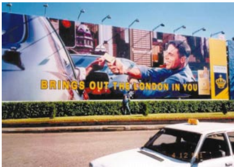
Despite Myanmar still being a comparatively closed society, British American Tobacco seems to have had no trouble moving in and putting up this giant billboard in the capital, Rangoon.

Perhaps it is all part of a highly practical view of man's life cycle, originally developed several millennia ago in some little known corner of India's long tradition of philosophy, and imbued with a particularly stoical acceptance of life's many sufferings. In India, these include a massive amount of cancer and other diseases caused by tobacco, resulting in at least 600 000 premature deaths each year, possibly as many as a million. The theory might go like this: cigarettes kill about half their lifetime users before their time, thereby increasing the potential availability of dead bodies for research. This in turn helps train more doctors and scientists, who produce new advances in the prevention and cure of disease,