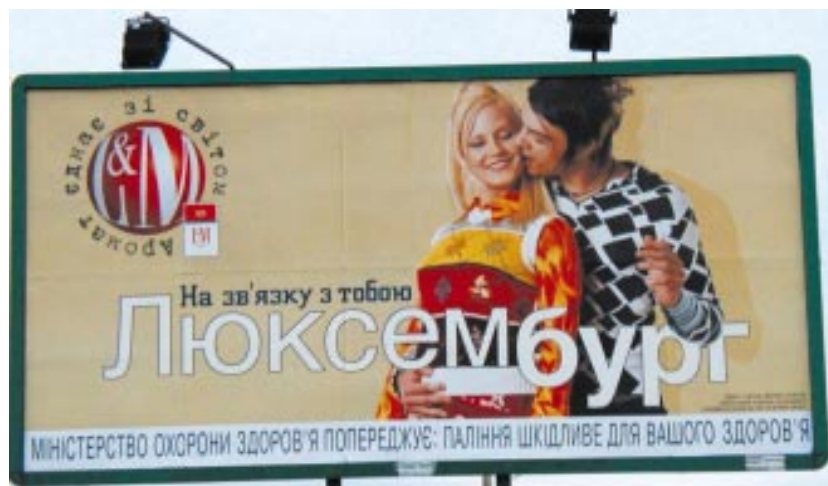
Ukrainian advertisement for the Philip Morris brand L&M, seemingly encouraging smoking during pregnancy.

All these culminated in the Keep Saen Saeb Canal Clean Project, created