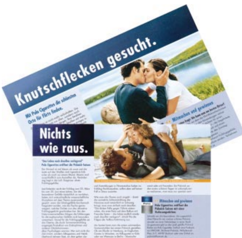
Another cigarette advertising campaign in Unicum , this time for Polo cigarettes, featuring young couples embracing and inviting readers to send in their suggestions for the best places to flirt.

aged 16 or more to smoke if they want to. Revealingly, efforts to curb street vending machines, a popular source of cigarettes for young people, were strongly challenged by the industry. Eventually a compromise was reached, with the machines being upgraded—this is high tech Germany—with microchips that respond to identity cards to restrict sales to adults. Sales are therefore down, but it does at least preserve the 800 000 machines on Germany's street corners; and it may not be unknown for young people to borrow their older siblings' or friends' ID card to make a purchase. Magazine ads often refer readers to websites leading to tobacco promotion pages where attractive prizes can be won, ideal for attracting young people, with their superior web navigation skills.