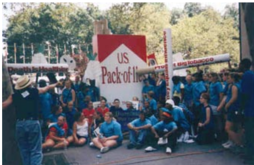
Demonstrators outside the UN building in New York, calling on the US government to take a more responsible role in the FCTC negotiations.