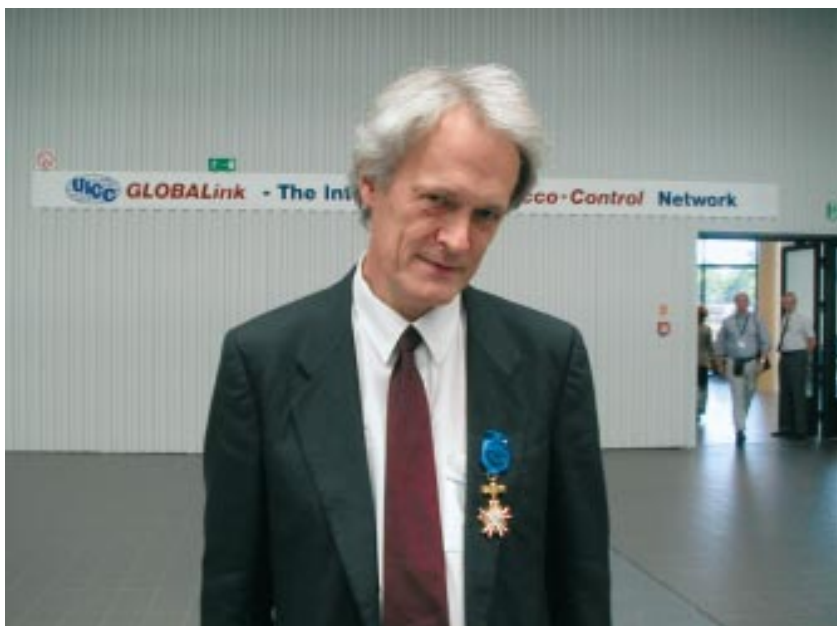
At the opening session of the Third European Conference on Tobacco or Health held in Warsaw in June, the First Lady of Poland, the wife of the country's President, invested British epidemiologist Professor Sir Richard Peto with the Order of Merit of the Republic of Poland (Officer Cross) for his contribution over many years to the country's long and successful fight against diseases caused by tobacco.

It should be added that having no budget for this sort of thing, the doctors who organised the meeting