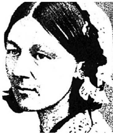
Florence Nightingale, the 19th century reforming British nurse.