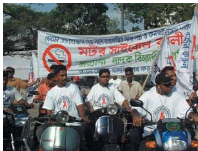
Bangladesh bikers demonstrating against BAT's Star Search promotion for Benson & Hedges cigarettes.

The rally was organised by Pratyasha, an anti-drug organisation, and the Welfare Association for Cancer Care, with participation by Work for a Better Bangladesh. The two-wheel protest was yet another example of the creative tobacco control and advanced networking for which Bangladesh health advocates have become renowned in recent years. And tobacco industry people may care to reflect that none other