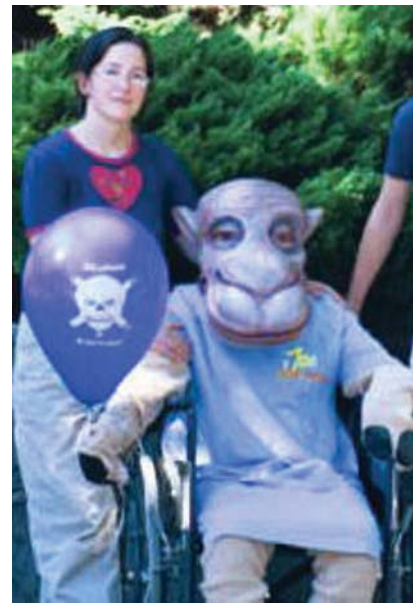
Joe Chemo, a satirical character used in demonstrations against tobacco promotion before Canada’s total ban, being wheeled to a tobacco sponsored fireworks display in Vancouver. This sort of story and image regularly appeared on the benensonandhedges.org website.

UK: Scotland prepares for smoke-free vote A postcard developed by CAN!, a coalition group campaigning for “cleaner air now”, for people in Scotland to use to lobby members of the Scottish parliament to support a bill to make all workplaces smoke-free, along the lines of the pioneering legislation in Ireland.