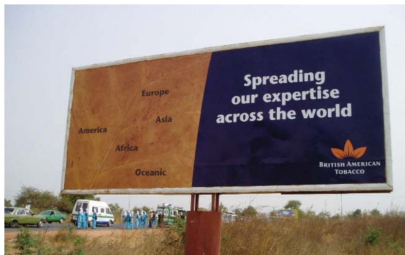
Gambia: BAT's boasts British American Tobacco's public relations advertisements hold a second, sinister meaning for African tobacco control advocates trying to prevent increasing recruitment to smoking in some of the world's poorest countries.