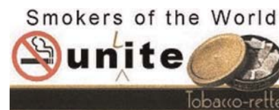
An advertisement for the Swedish Match company's oral tobacco product, Tobaccorette.

As public health workers around the world continue to debate harm reduction policies, including the place within them of oral tobacco, South Africa may be about to see whether a significant new body of South African cigarette smokers replaces some or all of their smoking with snus. They will also be watching to see how BAT markets the product and whether it tries to make health claims about it. Last year, scientists at the University of Pretoria confronted Swedish Match about health claims on a website advertisement that implied that Tobaccorette had no health hazards. The company later shut down the site, claiming it had not approved of the ad.