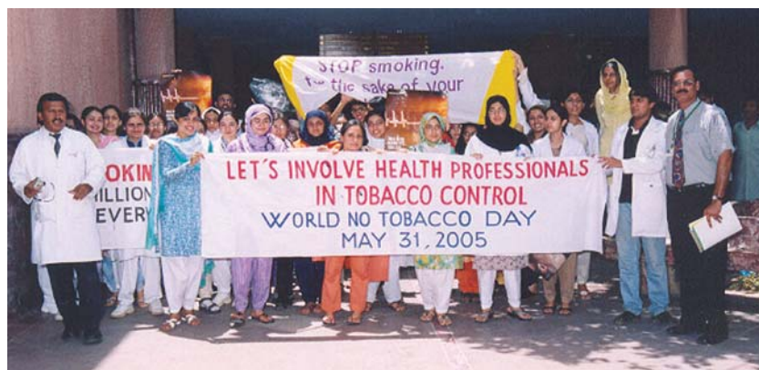
Pakistan: health professionals rally Medical students and staff from the Aga Khan University, Karachi, with the banner they used on World No Tobacco Day (31 May) calling for greater involvement in tobacco control by Pakistan's health professionals. Some 50 doctors, mostly members of the Pakistan Chest Society, joined students and others at events to mark the day, including a funeral procession with a giant cigarette instead of a coffin.

internet website, but the sale drew widespread attention and more than 130 000 bids earlier this year. It was not just any old butt, but one certified by the owners of Malt, a popular bar in Auckland, New Zealand's largest city, to be the remains of the last cigarette