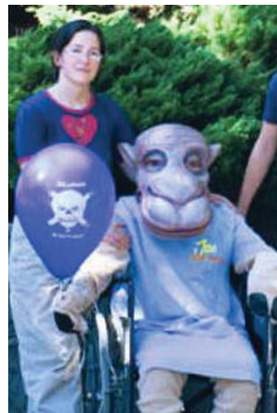
Joe Chemo, a satirical character used in demonstrations against tobacco promotion before Canada’s total ban, being wheeled to a tobacco sponsored fireworks display in Vancouver. This sort of story and image regularly appeared on the benensonandhedges.org website.

UK: Scotland prepares for smoke-free vote A postcard developed by CAN!, a coalition group campaigning for “cleaner air now”, for people in Scotland to use to lobby members of the Scottish parliament to support a bill to make all workplaces smoke-free, along the lines of the pioneering legislation in Ireland.