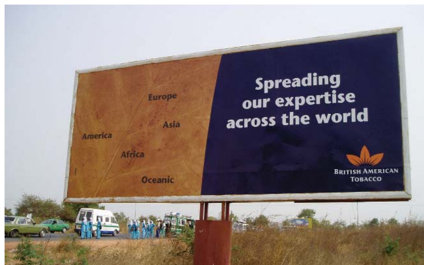
Gambia: BAT's boasts British American Tobacco's public relations advertisements hold a second, sinister meaning for African tobacco control advocates trying to prevent increasing recruitment to smoking in some of the world's poorest countries.