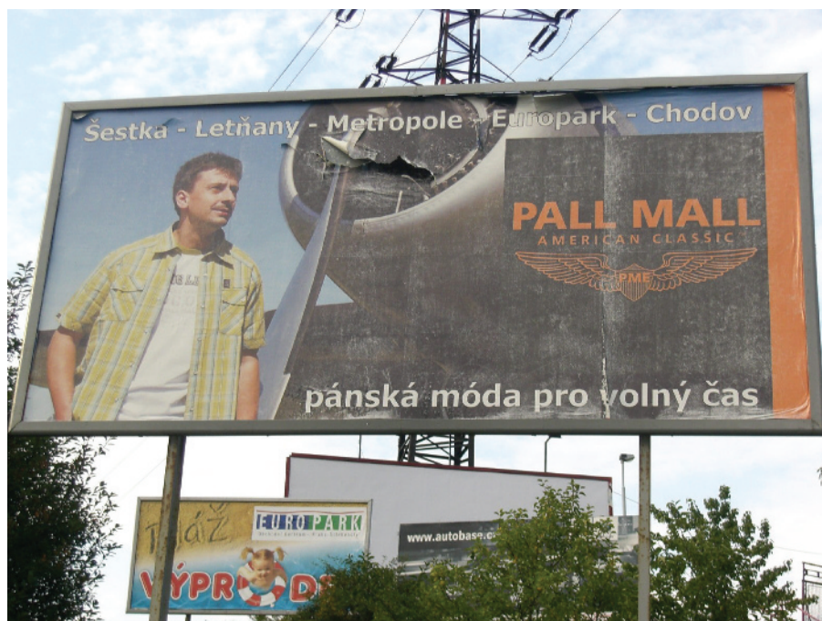
Czech Republic: billboard in Prague promoting Pall Mall clothes, August 2007