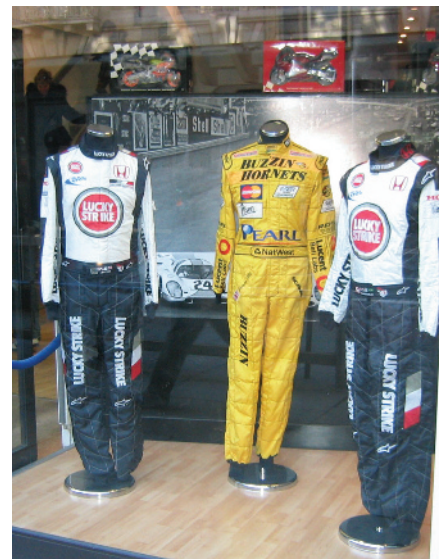
UK: mannequins dressed in Formula One driving suits promoting Lucky Strike and Benson & Hedges cigarettes, in a shop in London's west end this year.

Tobacco companies will keep testing what they can get away with in their efforts to attach the most persuasive images to their cigarette brands, even in countries with total bans on promotion. If they