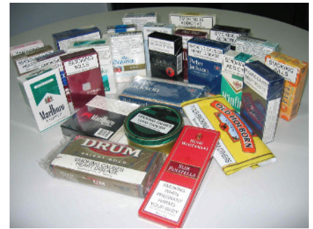
Australia: some of the outdated tobacco packs found during ASH Australia's survey.

ASH surveyed 40 shops (10 supermarkets, 10 general "convenience" stores, 10 petrol stations and 10 tobacconists) in the city and inner suburbs. At 28 shops, ASH was able to buy either cigarettes or roll your own or cigars carrying the old warnings—including from all 10 of the tobacconists, eight of the convenience stores and five each of the supermarkets and petrol stations. In the big supermarket chains and petrol stations where turnover was high, there was less evidence of stockpiling. In all cases, less than 5% of the packets in the shops carried the outdated warnings.