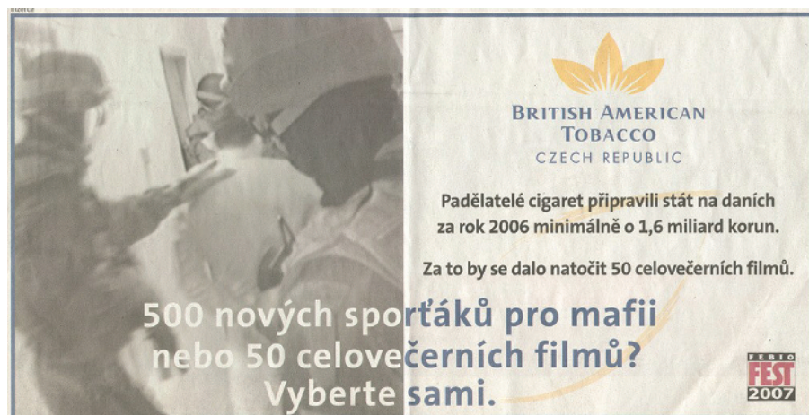
Czech Republic: one of BAT's ads promoting its sponsorship of the Febiofest film festival and making a point about sales of fake cigarettes.

that are regularly required to enforce and strengthen tobacco control laws.