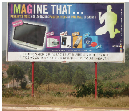
Cameroon: B&H stall

Now, however, tobacco billboards are reported to have largely disappeared, though cigarette emblazoned umbrellas at sales booths and restaurants are still common. Tobacco manufacturers, no doubt using the hospitality trade to do their dirty work, will squeal loudly if and when the government acts to remove remaining promotional items, but that and many other measures will cost nothing to implement. Health warnings, for example, currently contain classic tobacco industry language to indicate uncertainty about smoking causing disease: printed in both French and English,