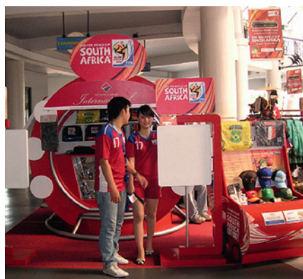
Indonesia: a stand in a shopping mall in Jakarta advertising tobacco company Gudang Garam International's sponsorship of the telecast of World Cup soccer.

But it seems Imperial has now turned to other means of ensuring its brands are available cheaply on the market. In January 2010, a promotion was spotted in a newsagent's shop in Stevenage, the most deprived borough in Hertfordshire, a county in the South East of England. John Player Special Silver, Menthol and King-size, along with Windsor Blue, Imperial's major ultra-low price brands, were being offered at well below market value. At £4 (US$6) for one packet and £6 (US$9) for two, smokers making a dual purchase of John Player Special Silver could make a saving of £1.52 (US$2.28)