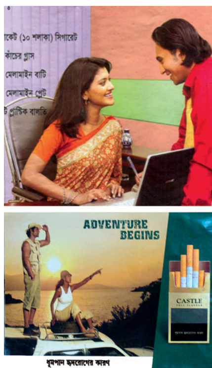
Bangladesh: two of the latest cigarette advertisements that health advocates are convinced are trying to make smoking socially acceptable for women.

For the first time, women seem to be the target of cigarette advertisements in Bangladesh. In the past, women in most countries, especially low income countries, had a sort of cultural protection from diseases caused by tobacco. True, this came about from factors other than those dictated by health concerns, even if they did lead to women living longer than men. Cultural taboos and lack of control over domestic budgets no doubt had many disadvantages, but meant that women were slower to take up tobacco use and hence to succumb to tobacco-induced diseases. When taboos have faded and