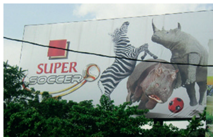
Indonesia: a roadside billboard in Jakarta advertising the Djarum tobacco company's sponsorship of soccer, during the World Cup season.

South Africa playing football, connecting people all over Indonesia to the World Cup. The only problem was, the billboards were advertisements for a local tobacco company, Djarum.