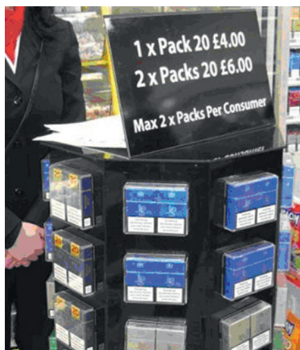
UK: a display of cut-price cigarettes at a retail outlet in a low income town.

per pack or 34 per cent compared with usual retail price—the typical price in a supermarket was £4.52 (US$6.80).