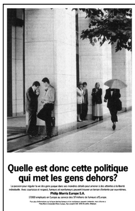
Switzerland: a Philip Morris ad from 1995 campaigning against smoke-free workplaces.