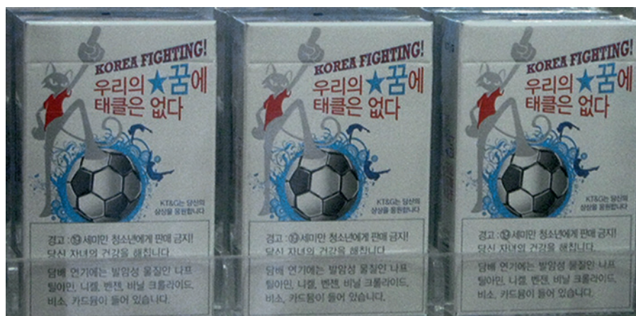
South Korea: a special World Cup cigarette brand made by a local company, displayed at a retail outlet in the capital, Seoul.