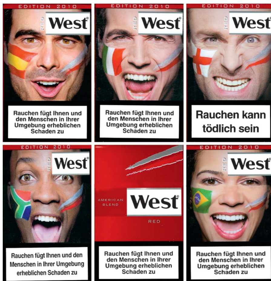
Germany: packs of West cigarettes purchased in late May, 2010. Clockwise from top left are packs with the flags of Spain, Italy, England, Brazil and South Africa painted on the cheek of a football supporter. The pack in the middle of the bottom row is the regular West design.

As the 2010 football World Cup approached, a special edition of West cigarettes went on sale in Germany. It comprised a series of packs, each consisting of a photograph of