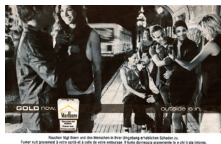
Switzerland: an ad for Philip Morris's Marlboro Gold cigarettes, portraying smokers who have to smoke outside as an "in-group".

a fun group to belong to, a classic promotional ploy used by every tobacco company to attract and maintain the youngest sector of its customer base.