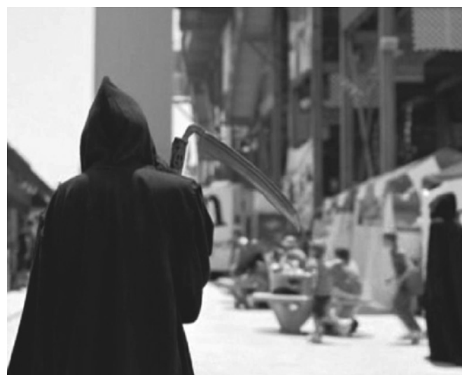
Figure 3 Scene from California Tobacco Control Program television advertisement to raise awareness about the deadly nature of free tobacco product distribution.