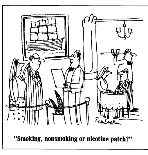
From the Wall Street Journal, reprinted with permission of Cartoon Features Syndicate