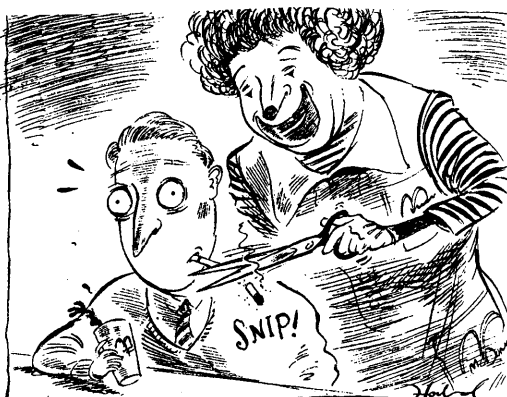
By Gary Hovland for the Washington Post, reprinted with permission. This cartoon ran shortly after McDonald's announced, on 23 February 1993, that it would test a smoke-free policy in 40 to 50 of its 9000 restaurants across the United States while it considered implementing a permanent smoking ban for all its outlets.