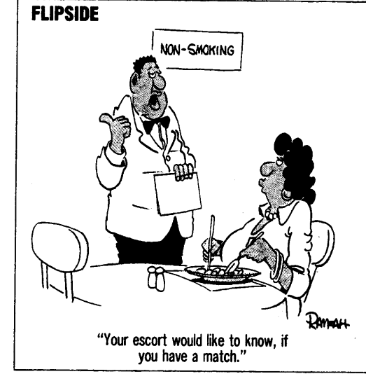
By Abdel Aziz Ramsah, reprinted with permission