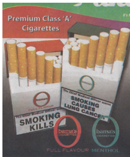
Jamaica: part of a newspaper advertisement for the bama's brand of cigarettes when they were launched on the market in January.

Jamaica has become the latest market for a cigarette brand called 'bama's'. Imported from an American company by a local businessman, the brand's name is printed on the pack inside a large letter O, shamelessly exploiting the name of US President Barack Obama. As the first African American President of the USA, Mr Obama is a hero of many Jamaicans,