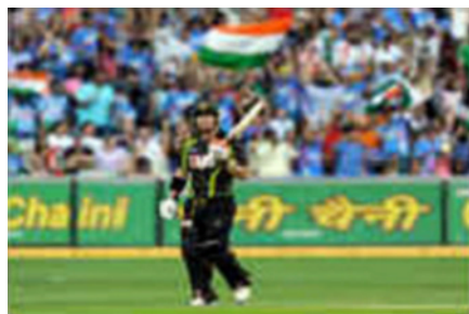
India/Australia: how the ad for Chaini brand, which includes an oral tobacco product, appeared on television.

advocates expected a long wait for a response from their 'sleeping' government.