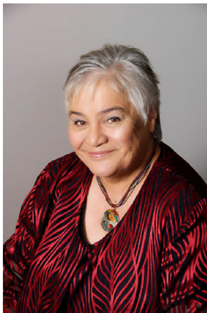
New Zealand: Tariana Turia, associate health minister, who pointed out the conflict in her country's ambassador to the USA being the co-host of a trade reception in Washington DC sponsored by Philip Morris.

Unfortunately, the social development values held by some of New Zealand's Māori (indigenous) politicians are unlikely