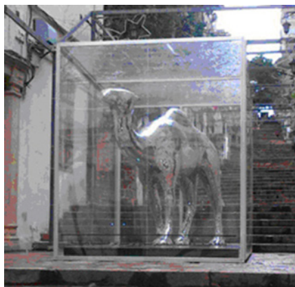
Lebanon: a sculptured camel in a glass case in an area of Beirut noted for art shows and nightlife.

Kent cigarette ads also appeared in anomalies spotted by health advocates. One large advertisement above a Beirut