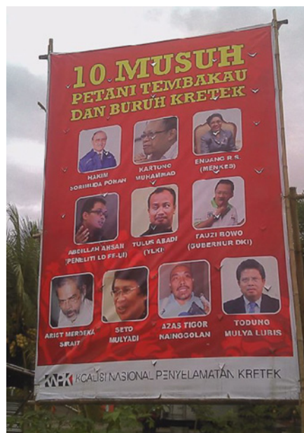
Indonesia: one of the billboards put up by a pro-tobacco group in Java, depicting prominent tobacco control advocates.

tobacco industry has underpinned support for increasing tobacco tax, and hence revenue. He has also shown that contrary to industry propaganda, tobacco's contribution to the Indonesian economy is small and decreasing;