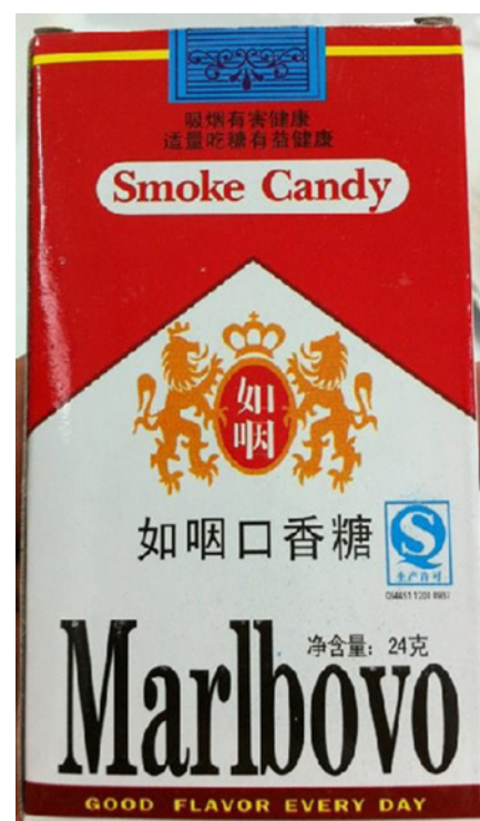
Laos: a pack of confectionery in a pack strongly resembling a Marlboro cigarette pack, found on sale in Laos last year.

So it was not surprising that when Philip Morris, manufacturer of Marlboro cigarettes, was preparing to sue the Australian government last November over its law on plain tobacco packaging, there was no word of any legal action or other complaint in Laos about a confectionery item on sale that strongly resembled a Marlboro cigarette pack, seen and photographed there at around the same time. In addition to the name and slogan in English the product carries text in Chinese, suggesting that it was made in China.