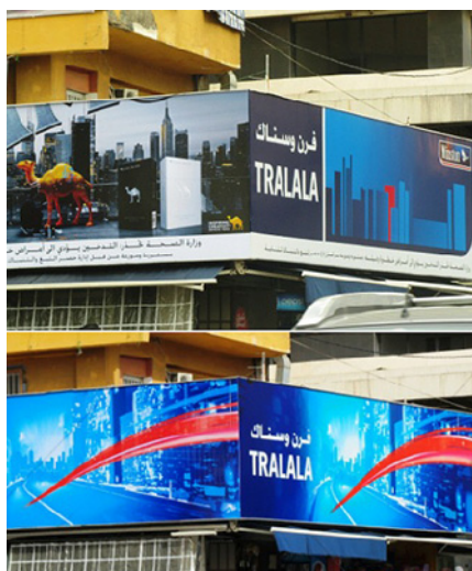
Lebanon: a shop front before (top) and after the advertising ban came into force.

Cricket Australia was later persuaded that there appeared to be 'strong parallels' between the product advertised during the matches and a brand of oral tobacco, and ordered the removal of the ads. It may be liable, nevertheless, to a fine of A$66 000 (US$69 400). Meanwhile, in India, a health organisation which in the past has filed many similar complaints about tobacco brand stretching, said health