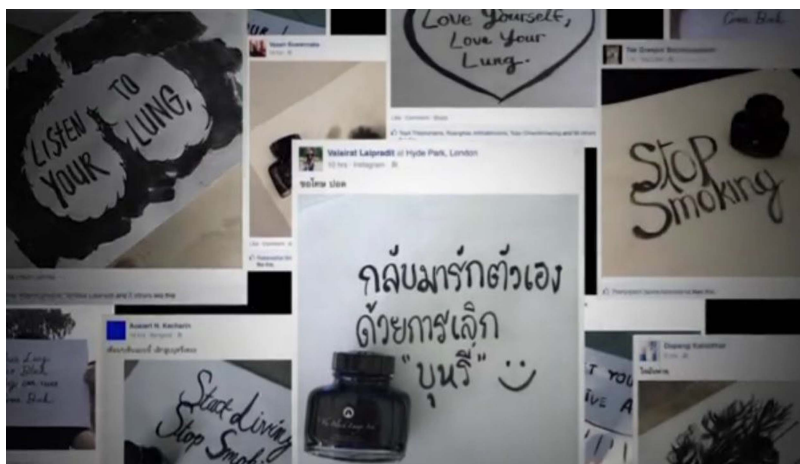
Artwork created from 'Message From The Lungs' ink

Message From The Lungs.