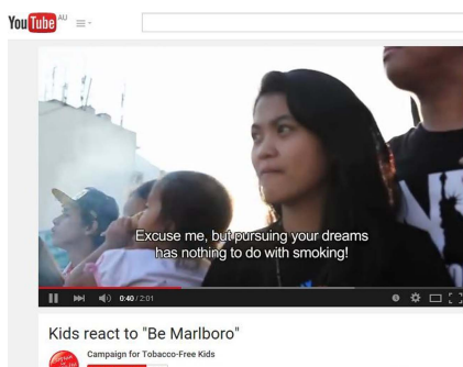
A screenshot from young people talking about the Be Marlboro campaign.