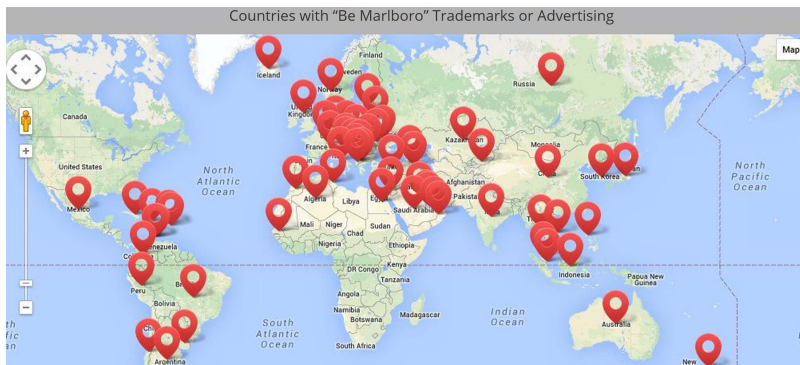
A map showing the countries with Be Marlboro trademarks or advertising.

profit consumer news site Consumerist recently reported that PMI has used copy-right muscle to remove a source of scrutiny.