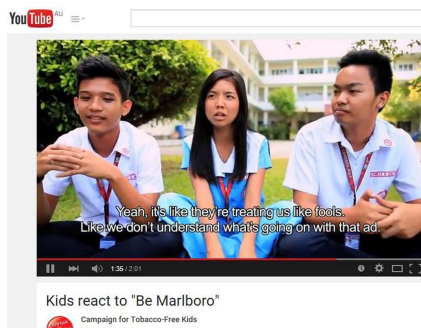
Filipino teens react to the Be Marlboro campaign.

The World Bank has withdrawn from the 12th Annual Asia Pacific Tax Forum, an event organised by the Indian Council for Research on International Economic Relations (ICRIER) and International Tax