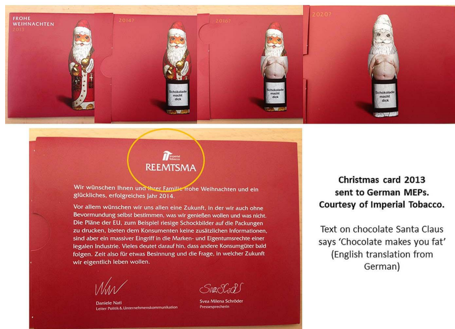
Christmas card 2013 sent to German MEPs.

Text on chocolate Santa Claus says 'Chocolate makes you fat' (English translation from German)