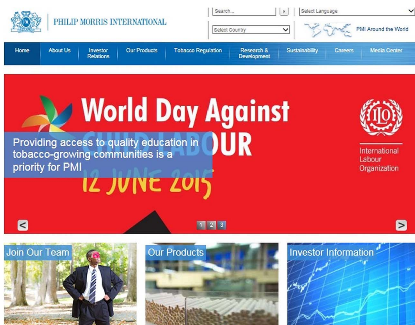
The PMI homepage showing the ILO logo

The agreement is with the august-sounding 'Eliminating Child Labour in Tobacco-growing Foundation' (ECLT). The ILO press release has a paragraph about ECLT: 'The Eliminating Child Labour in Tobacco Growing Foundation is a global leader in preventing child labour in tobacco agriculture and protecting and improving the lives of children in tobacco-growing areas. ECLT strengthens communities, improves policies, and advances research so that tobacco-growing communities can benefit from agriculture while