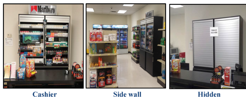
Figure 2 Photographs of the three experimental conditions that manipulate the location or presence of the tobacco power wall.

This study was approved by the Human Subjects Protection Committee at the RAND Corporation. The study used an authorised deception to balance the internal validity and ethical integrity of the research. During the consent process, conducted by a trained research assistant, participants and their parents were told about the general parameters of the study (eg, that the study involved assessing adolescents' convenience store shopping habits and was minimal risk) and that there were aspects of the study that they could not be told about because that