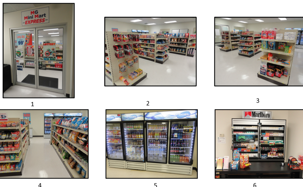
Figure 1 Photographs of the inside of the RAND StoreLab.

The façade of the RSL consists of a double glass door and window. A sign hangs above the door signifying the name of the store and various product posters hang in the glass window and door (photo 1; figure 1 ). The space includes three shelving units and endcaps where name brand food and small household items can be found (photos 2–4; figure 1 ). Two refrigerators, one large freezer and two smaller freezers occupy another wall (photo 5; figure 1 ). A coffee maker, microwave oven and pastry display sit on another wall.