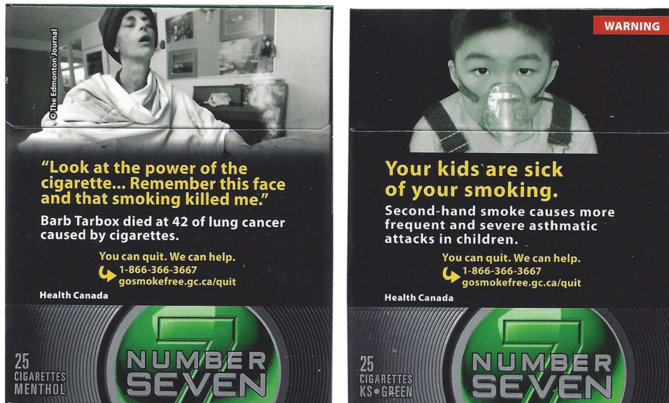
Figure 1 Left: Number Seven menthol pack preban with the 'menthol' descriptor at the bottom left; Right: Number Seven menthol replacement pack postban with the 'green' descriptor at the bottom left.