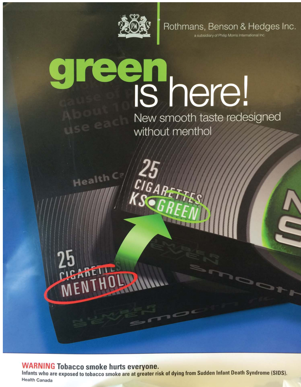
Figure 3 Business-to-business marketing materials from Rothmans, Benson & Hedges (owned by Philip Morris International), demonstrating the shift to menthol replacement packs.