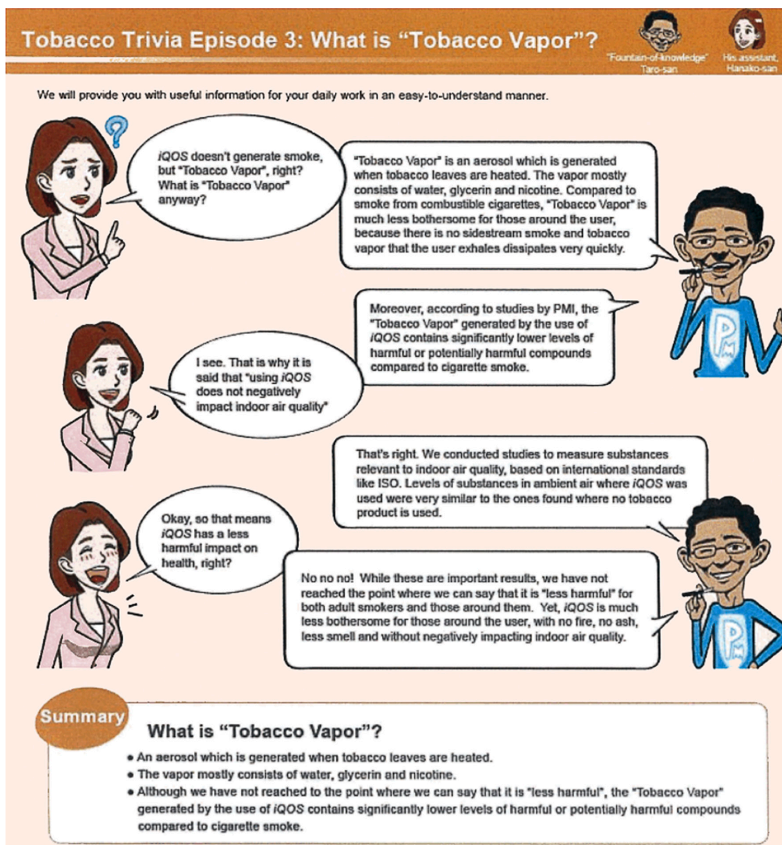
Figure 2 Excerpt from an internal October 2015 Philip Morris Japan newsletter. To clarify employee understanding of IQOS, a mock employee asks: '... iQOS has a less harmful impact on health, right?' The company expert replies, 'No no no! While these [ambient air reductions] are important results, we have not reached the point where we can say that it is "less harmful" for both adult smokers and those around them.' 74