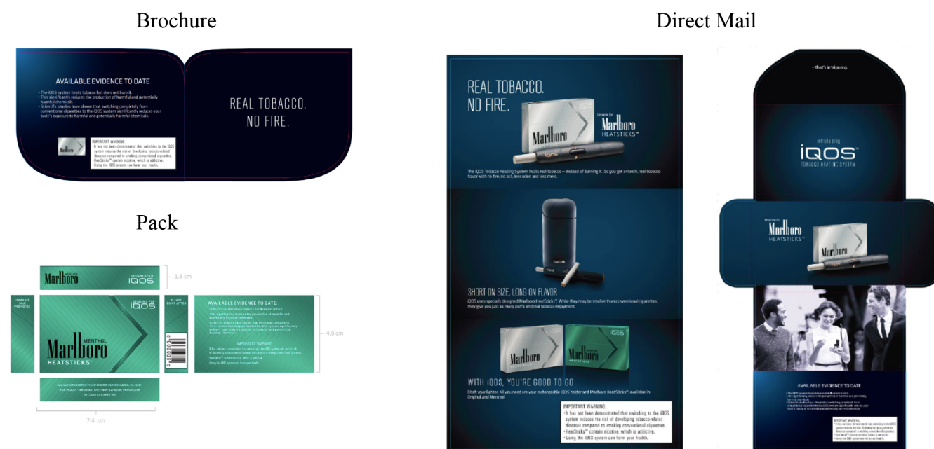
Figure 2 Reduced exposure message and an example of marketing materials from study THS-PBA-05-REC-US. In study THS-PBA-05-REC-US, all marketing materials carried a reduced exposure claim. PBA, Perception and Behavior Assessment; PMI, Philip Morris International.

therefore, mislead the public. While few studies outside the tobacco industry evaluated consumer perceptions of reduced risk or reduced exposure claims for non-cigarette tobacco products, 32–34 the results were similar. El-Toukhy et al 34 found that modified exposure claims reduced perceived risks of snus and e-cigarette products among adults and adolescents. These results indicate that perceptions of exposure and risk are highly correlated and communication about one—either lower risk or lower exposure—reduces perceptions of both risk and chemical exposure.