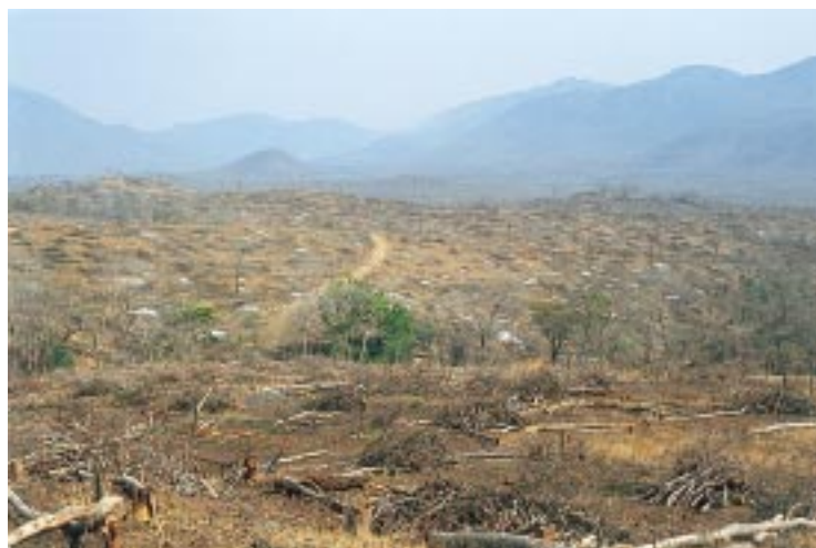
Figure 3 Several hundred hectares of natural (“miombo”) woodlands were cleared in a wood-energy project financed by the World Bank, to provide wood to nearby tobacco farms and urban users in southern Malawi. Unfavourable prices at the time resulted in the burning of large areas of tree cover. The area is an environmentally critical watershed zone of the east African Rift Valley, and is now a government-owned plantation forested with fast-growing exotic species, such as eucalyptus .

tobacco-related forest removal (0.6%). A medium-to-serious degree of deforestation by tobacco presumably exists in parts of South America (Argentina, Uruguay, Chile, Colombia), the Caribbean (Cuba, Dominican Republic, Haiti, Jamaica, Trinidad and Tobago) and central America (Honduras, El Salvador, Guatemala). The situation seems especially critical in Cuba and the Dominican Republic, with both holding large shares of tobacco in arable land and not having sufficient forest cover. Although having small amounts of land under tobacco, environmental criticality could be assumed in Haiti, El Salvador, Jamaica, and Trinidad and Tobago. Despite a sufficient forest cover, looming wood scarcity due to tobacco is likely to emerge in Honduras and Guatemala where tobacco land expansion has exceeded the growth of arable land during the past 15 years. Among other developing countries with low-to-minor degrees of tobacco-related deforestation, only Costa Rica, Ecuador, and Paraguay show a trend towards emerging criticality (while no such indication is found in Brazil).