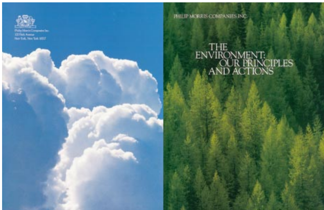
A Philip Morris publication, describing the company's principles and actions to protect our water, air, and land.