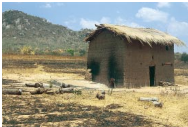
Figure 2 Remaining pieces of firewood surrounding a curing barn in southern Tanzania. An estimated tractor-load of wood (approximately 3 tonnes of solid wood) taken from common woodlands was used to cure the total harvest of tobacco grown on fields around the barn in the 1997/98 season. The hills in the background have been denuded for about 35 years, because of overcutting for tobacco curing.

countries of Asia/Oceania (3.7%) and lowest in the Americas (0.6%).