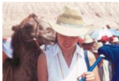
Marlboro advertising, this time on hats, manages to appear in the most remote parts of the world.

The smoking rates in China have not decreased in the last 20 years and the population increases during this period means that there are now more smokers. It is disappointing that the