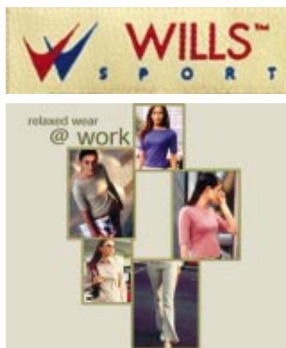
Wills Sport, the latest name in fashion wear now being promoted in India.

products. It had stated in its invitation to the meeting that the Mongolian parliament was one of the organisers of the event. "However, they did not receive official permission from the Mongolian parliament to do this. One of the ways that this company, which has lost customers in countries that have strong laws against tobacco, has tried to hook children, young people, and women on smoking is by violating the laws and regulations of the independent country of Mongolia by using the name of its supreme law making organ, the Mongolian parliament. The Philip Morris Company must bear the responsibility for the negative consequences incurred by using the name of the parliament". If only . . .