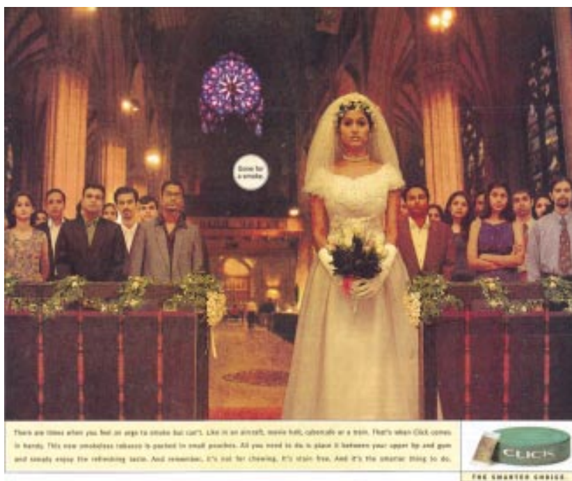
Advertisement appearing in an Indian newspaper for Click, Swedish Match's new smokeless tobacco product.

Currently there are few restrictions on the advertising and sale of smokeless tobacco products in India. The situation may change soon as a comprehensive bill is under consideration in the Parliament that would ban advertising of all tobacco products. Swedish Match has probably launched Click specifically at this time so as to be able to advertise this new product before a bill is passed into a law and comes into effect.