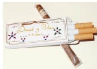
Tobacco is such a part of Spanish wedding tradition that cigarette gift boxes, inscribed with the names of the bride and groom, are often handed out to guests.

But at the celebratory wedding meal, what was in the traditional baskets of personalised gifts brought round from table to table by the happy couple, and handed to all the guests? Boxes, beautifully hand decorated with hearts and flowers and the names of the bride and groom, containing cigarettes for all the women, and cigars for the men. So much is tobacco a part of Spanish wedding tradition that cigarette gift boxes ready for decoration are to be found in