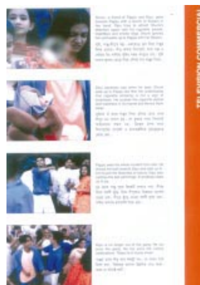
A glossy BAT brochure showing scenes from TV commercials in its youth campaign.

Research by a coalition of health groups has led to strong condemnation of a new scheme launched in July by BAT. BAT described its programme as a “comprehensive campaign on youth smoking prevention”, and it was formally launched by Bangladesh's Home Secretary at a meeting in a prestigious hotel, attended by a large group of what BAT calls “stakeholders”. BAT loves