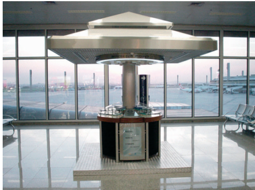
BAT's "Smoking point" which was recently banned from Rio de Janeiro's airport.

"When my father was living, too, the manner in which they treated my father was not right. The Foundation had power to the extent to control my father. Soon after his death they just stopped the allowance due to my mother and she was very disappointed. After a couple of months she too passed away. When my father was alive they took away his entire valuable, old paintings, which he had dearly collected for years. They said they wanted to sell them for the maintenance of the Foundation. But what is the Foundation doing now? They