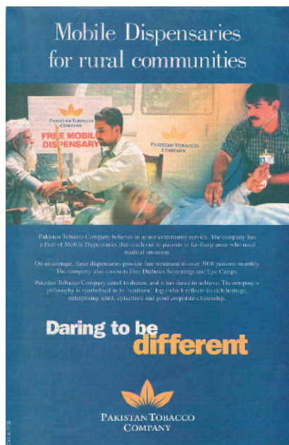
One of several advertisements appearing in newspapers in Pakistan extolling the virtues of the Pakistan Tobacco Company (PTC), the local subsidiary of British American Tobacco.

As in all the ads, the copy under the mobile dispensary picture ended, "PTC dared to dream, and has dared to achieve". It is true, of course: PTC/BAT has dared to be different, and has dared