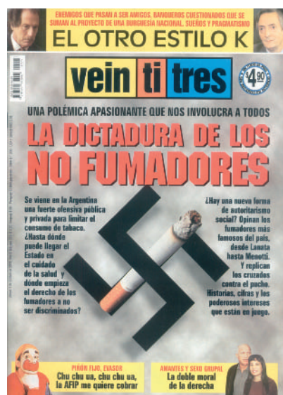
Cover of the Argentine magazine Veintitrés , bearing a swastika under the title “The non-smokers’ dictatorship”.

A state wide survey by San Jose State University has shown that Californians with health insurance overwhelmingly support the inclusion of smoking cessation treatment in standard health insurance coverage. Seventy one per cent believed medications and programmes to help smokers quit should be part of standard health benefits, and 72% agreed that employers should offer employees insurance that includes coverage for stop-smoking benefits. Despite