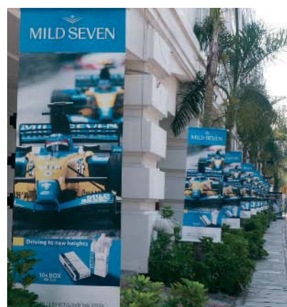
Saturation tobacco promotion was very much in evidence at the recent Formula One motor race in Malaysia.

Anyone who visited Malaysia in the 1980s and who turned on the television set in their hotel room was likely to see more tobacco promotion than they had ever seen before in a half hour of channel hopping. If they were there on public health business, they had an additional shock when they learned that the country had banned tobacco advertising on television. Ministry of health officials would announce this with sincerity, though some of them would admit that there were problems of circumvention. Did these stem from cross border television, which can be so troublesome to a tobacco control leader with less enlightened neighbours? No, the ads were on Malaysian TV, but were not for cigarettes at all, but for those well known but impossible to obtain products such as Marlboro and Kent holidays, or Camel clothing. In those days, no tobacco control advocate's conference presentation was complete without slides or video clips showing how tobacco companies were exploiting Malaysia and its innocent government.