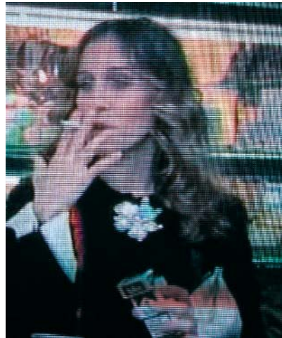
The "Sex and the City" season finale, in which the central character Carrie Bradshaw took up smoking again, appeared to glorify the activity.

In the case of "Sex and the City", Ms Parker might have chatted with William B Davis, the "cigarette smoking man" of the wildly successful series, "The X-Files". Davis, the arch villain of the series, was almost never seen without