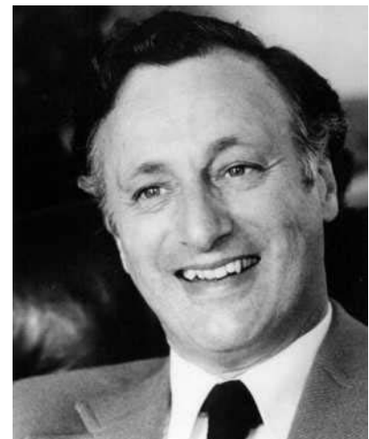
Actor Paul Eddington: an ASH supporter.

Eddington, a Quaker, had a long history of quiet involvement with important causes. When necessary, he was prepared to be a little less quiet, as when he publicly resigned in protest from the board of trustees of the Bristol Old Vic theatre company after it refused to end sponsorship from Wills Tobacco, which had a large factory in the city. He was a founder of a high profile group opposing tobacco sponsorship of the arts, and helped Action on Smoking and Health (ASH) on several occasions. Sadly, he did not live to see the UK's ad ban—he died of a rare form of skin cancer in 1995—but he inspired and enlivened ASH's work towards it.