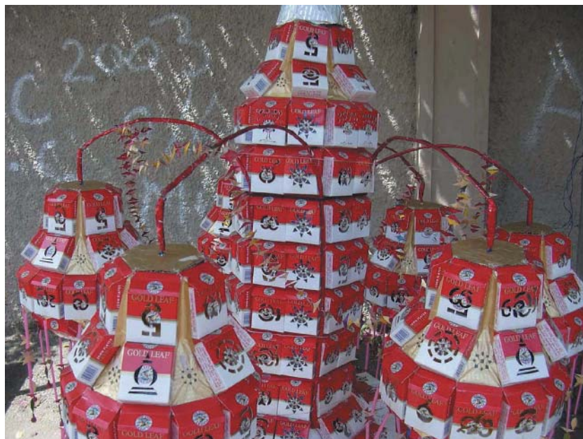
Traditional lanterns made from about 4500 Gold Leaf cigarette packs, on display at a Buddhist temple in Sri Lanka.

About 4500 Gold Leaf packets were used to make the lanterns, which were seen by some 20 000 people.