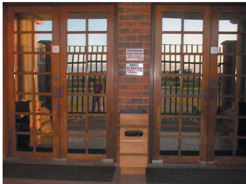
Entrance to the Mossel Bay Magistrates Court in South Africa, where smoking is now banned, with a sign saying in both official languages “No smoking within 10 metres of entrance”.

In May, Ceylon Tobacco Company (CTC), the Sri Lankan subsidiary of BAT, organised the donation of alms to devotees celebrating Vesak (the birth, attainment of Buddhahood, and passing away of Buddha) at Ranmuthugala Buddhist temple. Its priests were also offered alms the following day by the country's President at his official residence, reportedly with CTC officials in attendance. Traditional Vesak lanterns made from cartons of CTC's Gold Leaf cigarettes were also seen at the temple. Ironically, they had been made by residents of a rehabilitation centre for victims of alcohol, tobacco, and heroine.