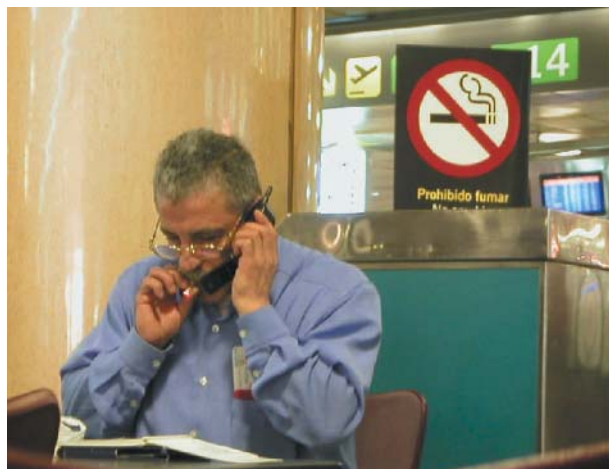
Left: A smoker at Madrid airport blatantly ignores the no-smoking sign behind him. Right: A UK ad placed by BAT, advertising for “Business Managers (Hotels, Bars Restaurants and Clubs)”, indicates that existing ad bans are unlikely to be enough to stop the next generation of tobacco promotion.

Confusingly, government authorities and the Turkish Automobile Federation subsequently sought to reassure the public health community that the race would, after all, be tobacco-free. If the tobacco companies agreed, presumably they had in mind the sort of “tobacco-free” extravaganza of tobacco