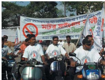
Bangladesh bikers demonstrating against BAT's Star Search promotion for Benson & Hedges cigarettes.

The rally was organised by Pratyasha, an anti-drug organisation, and the Welfare Association for Cancer Care, with participation by Work for a Better Bangladesh. The two-wheel protest was yet another example of the creative tobacco control and advanced networking for which Bangladesh health advocates have become renowned in recent years. And tobacco industry people may care to reflect that none other