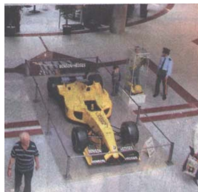
A small child (just right of car) admires a Benson & Hedges F1 racing car displayed recently in Metroland, a large shopping mall in Istanbul.

Having started in a surreptitious way, the advance of Formula One (F1) on the previously auto-sportingly uninterested people of Turkey went public in 2003, when a curious ceremony was held to begin work on the country's first F1 track (see Tobacco Control 2003;12:346–8). It was curious not because the prime