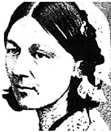
Florence Nightingale, the 19th century reforming British nurse.