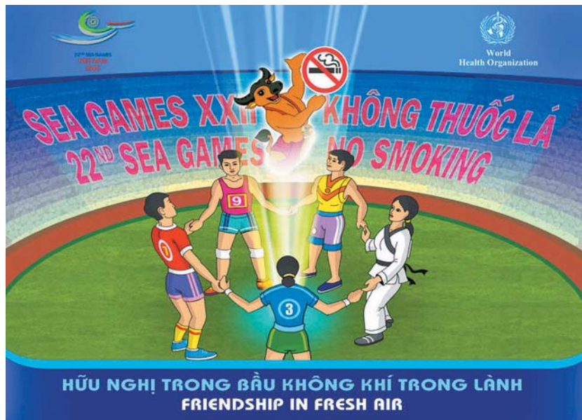
Poster promoting the first ever smoke-free South-East Asia games.

the exercise had also produced wider gains for public health. It reinforced existing tobacco control policies and put tobacco firmly on the agenda, not just in Vietnam, but in all 11 participating countries, whose ministers of health all received detailed information about it. Health officials spoke of excellent inter-agency cooperation and support, and significantly increased knowledge and awareness of the health effects of smoking over a wide ranging population. WHO provided some US$30 500 for the implementation of the policy, making its success seem exceptional value for money, and enabling Vietnam to provide a valuable lead for others to follow.