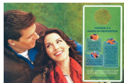
The new look Salem website could be mistaken for that of a health spa.

The main feature of the website as it stands now (there are some “coming soon” sections) are video clips that portray couples demonstrating different