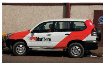
A pristine sports utility vehicle, emblazoned with the Marlboro logo, sits outside the entrance to the hotel where the recent annual conference of the African Organization for Research and Training on Cancer was held in Senegal.

During most of the four days of the conference, a sports utility vehicle (SUV), immaculately clean (rare for Dakar) and finished in full Marlboro regalia, was conspicuously parked at the entrance to the hotel, in full view of all the delegates and others who passed by. There was no activity connected to the SUV—it was just parked there, with a driver always in attendance. Perhaps it was a coincidence or, more likely, a subtle statement from the tobacco industry to say, "We know you cancer people are in there deliberating, and we want you to know that we're here, too—all the time." Very subtle. Those with