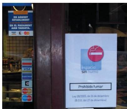
In Spain, a new law against smoking has been introduced, creating smoke-free environments in all larger public and private workplaces.

policy or not—and the first estimations indicate that only 5–10% of such bars have gone smoke-free. The law limits the sale and supply of tobacco products that can now be sold only at tobacco-nist's shops and smoke-permitted (smoke-polluted) bars and restaurants. Vending machines are hence prohibited in any other place. The legal age for buying cigarettes increases to 18 years old, and vending machines will include control mechanisms to restrict their use to adults. Regarding promotion, the law prohibits all type of advertisements, other forms of promotion, and tobacco sponsorship activities in all public and private media. Again there is an exemption: a further three years has been granted for sponsorship and publicity among participants and teams in motorcycle and Formula One international races.