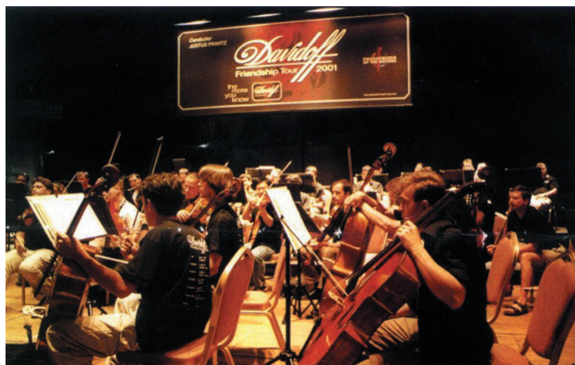
A Davidoff promotional banner over the Lebanon Youth Orchestra shows how tobacco companies can link their cigarette brands to positive, well publicised activities involving young people.

Star Academy is listed as one of the highest ranking TV shows by viewers watching LBC. In Lebanon, ratings have reached 80% among viewers aged 15 and 25 years. In Saudi Arabia, 53.6% of the programme's viewers are in the age group 15–24 years, 27.9% in the 25–34 age group, 9.7% are 35–44 years of age, and 8.8% are 45 and over.