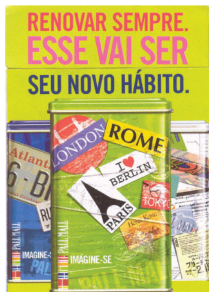
Brazil: special Pall Mall "collector" pack tins proved highly popular with fashion-conscious young smokers.

significantly greater prompting effect while the story was hot will never be known.