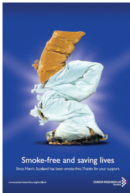
UK: a stubbed-out cigarette in the shape of Scotland celebrates the successful Scottish workplace-smoking ban.

In Scotland, which went smoke-free at the end of last March, more than nine out of 10 bar staff said that their workplaces were healthier in an opinion poll commissioned by Cancer Research UK just 6 months after the ban, with almost eight out of 10 of believing that the legislation would benefit their health in the long