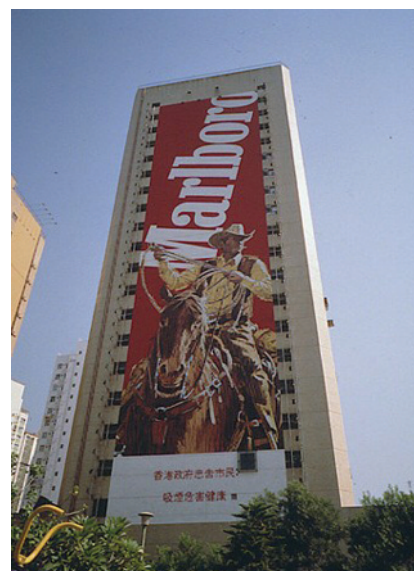
Hong Kong: how outdoor advertising used to be—public health workers fear the return of massive iconic advertisements now that the government has decided to allow continued cigarette brand-stretching promotions.

Second, and probably generating even more adverse comment in the media, was the exception whereby bars and certain other leisure venues, such as massage establishments and mah jong parlours, could register to continue allowing smoking until 1 July 2009. Apart from seeing this as a licence to poison hospitality industry workers for another 2½ years, creating a messy legal quagmire on a now unequal playing field, public health