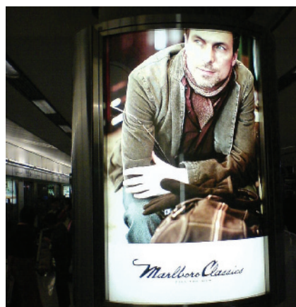
Hong Kong: a Marlboro clothing advertisement greets passengers arriving at Hong Kong's Chek Lap Kok international airport.

the culprit factories burning low-grade fuels are owned by Hong Kong businesses.