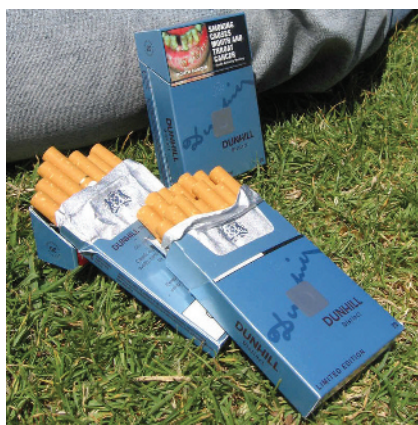
Australia: BAT's Dunhill pack split into its two sections.

twin pack is torn in half, the larger section is without the mandatory pictorial warning (such as a fetching picture of a gangrenous foot) arguably breaching the Trade Practices Act. Complaints from health groups to Australia's regulator, the Australian Competition and Consumer Commission (ACCC), in November saw the Federal Court of Australia uphold an injunction sought by the ACCC that BATA should stop selling the packs. With the packs having to be removed from shops, BATA will be back in court in February 2007, potentially facing a maximum fine of over A$1 million, equivalent to US$789 000, and a criminal record. Should this happen, such a record will not be lost as an extra descriptor for Australia's largest tobacco company.