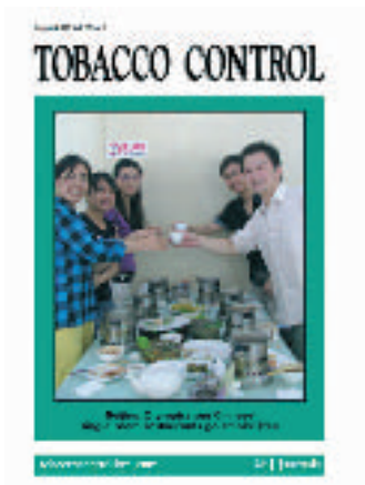
Cover: Beijing Olympics see Chinese single room restaurants go smoke free