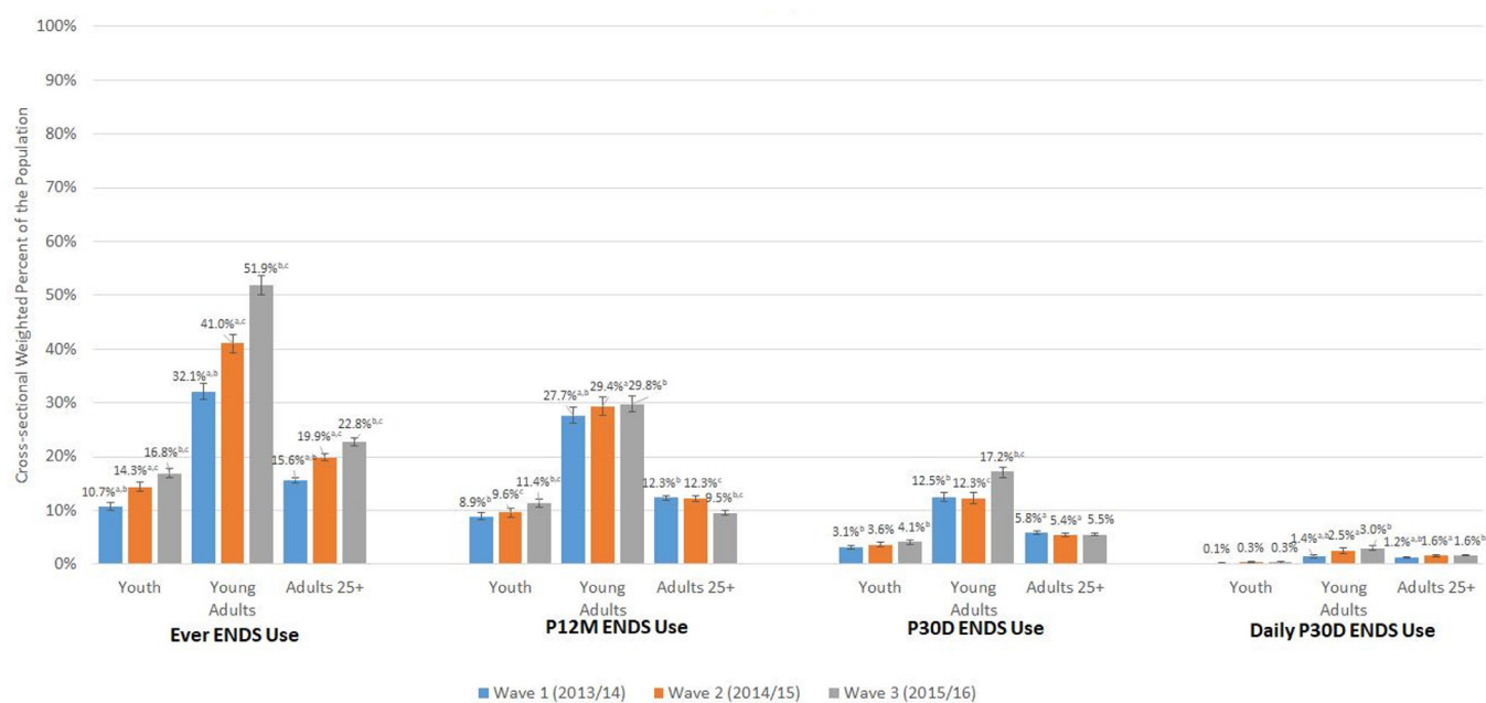
Figure 1 Cross-sectional weighted percent of ever, P12M, P30D and daily P30D electronic nicotine delivery systems (ENDS) use among youth, young adults and adults 25+ in W1, W2 and W3 of the Population Assessment of Tobacco and Health (PATH) Study.

Notes: Abbreviations: P12M = past 12-month; P30D = past 30-day; ENDS* = electronic nicotine delivery system; W1 = Wave 1; W2 = Wave 2; W3 = Wave 3