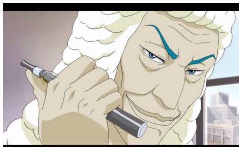
Figure 1 Viral meme image from Netflix original Neo Yokio . The image is widely available in meme form on multiple internet sites. An example site where you can embed it into your own social media post ( https://awwwmemes.com/i/good-thing-ibrought-my-vape-anime-boston---make-a-52d887ec8099434eb98fb88aaf1238b7 ).

Given anime's growing popularity among teens worldwide, we investigated if and how tobacco companies, including those that exclusively sell e-cigarettes and other vape devices, are using anime to market vaping products, through an exploratory online search of 'anime', 'e-cigarettes' and 'vape' conducted in September 2021. We conducted the search on Duckduckgo.com, an independent search engine that does not store personal data and search history, to minimise bias from authors' personal search history. We found numerous examples of strategies previously found to be effective in promoting tobacco use among adolescents and young adults, including linking products and behaviour to popular movies and