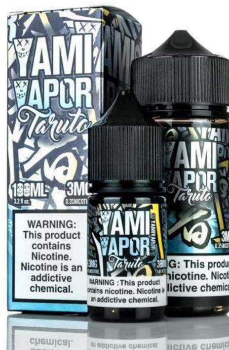
Figure 2 Product of Yami Vapor ( https://vapedrive.com/brand/yami-vapor/ ) featuring anime artwork and flavor (Taruto) named after an anime show Magical Meow Meow Taruto (accessed October 11, 2021).

video games; 6,7 using cartoon-based marketing; 8 and leveraging social media to market to youth. 9 We identified manufacturers branding their products after anime shows and characters; for example Yami Vapour is named after the character Yami in the show To Love-Ru , now steaming on Hulu. 10 We also found nicotine liquid named and marketed after popular anime shows and characters, including