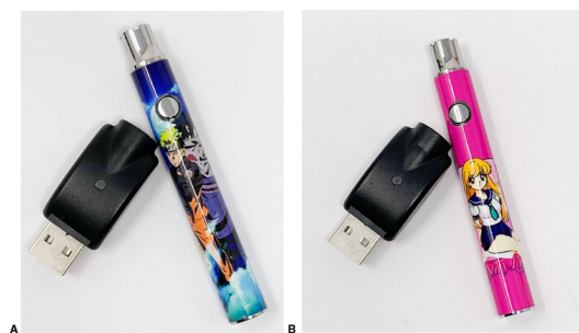
Figure 3 Vape devices covered in (A) Naruto , one of the most well-known anime shows worldwide, and (B) stereotypical anime blond girl in sailor uniform; both marketed by StayLit Designs, October 11. ( https://www.staylitdesign.com/products/510-threaded-battery-naruto-starter-kit ).

video games; 6,7 using cartoon-based marketing; 8 and leveraging social media to market to youth. 9 We identified manufacturers branding their products after anime shows and characters; for example Yami Vapour is named after the character Yami in the show To Love-Ru , now steaming on Hulu. 10 We also found nicotine liquid named and marketed after popular anime shows and characters, including