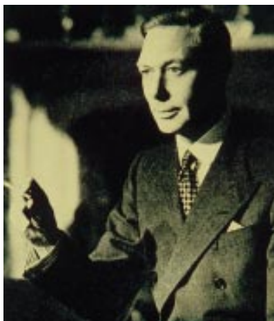
King George VI, the father of Britain's current monarch, smoked from the age of 14, had a cancerous lung removed in his early 50s, and died of heart disease at the age of 56.

This is the brand aimed at "young adult female smokers", as its advertisers would probably say, or girls, as cynical health experts might prefer to describe the target audience. Virginia Slims advertisements have irritated feminists and health advocates alike since the earliest ads informed women, whom they addressed as "Baby", that they had "come a long way". Whereas it had been taboo for their mothers' generation to smoke, they suggested, it was now OK to smoke, and a symbol of their new, hard won independence. After a drubbing from leaders of the women's movement, whose concern at that