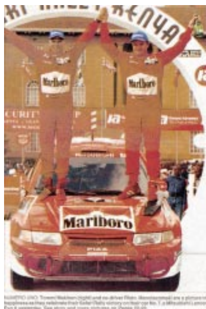
Motor sports, such as the Kenyan Safari Rally, still provide massive publicity for tobacco companies such as Philip Morris (Marlboro), who took over sponsorship of the rally from BAT (555).