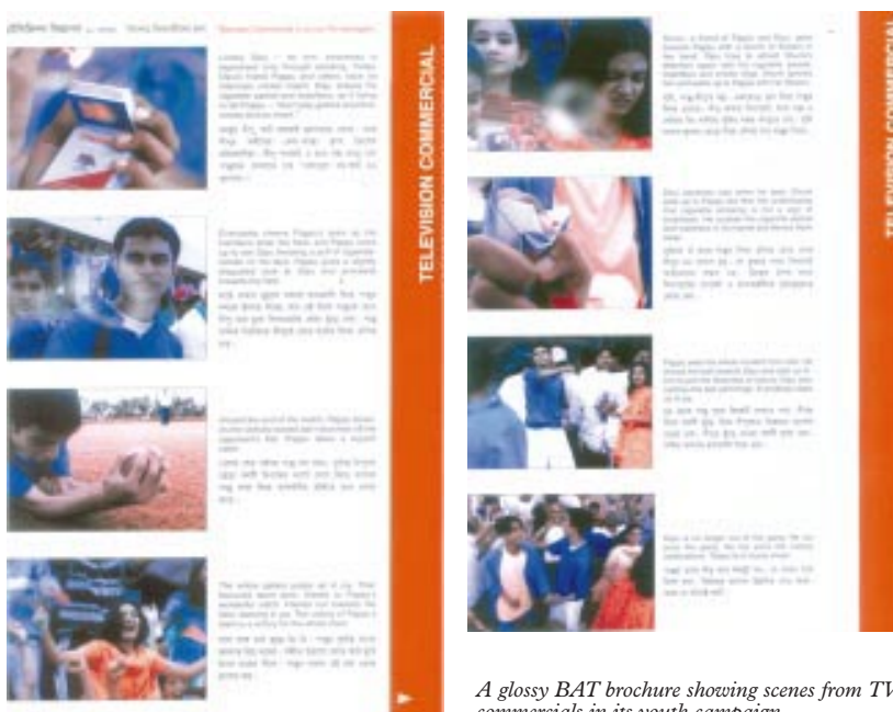
A glossy BAT brochure showing scenes from TV commercials in its youth campaign.

10th World Conference on Tobacco or Health in Beijing in 1997 has not resulted in any great leap forward. With about two thirds of men and 4% of women smoking in China, no stone should be left unturned in bringing down these high male rates and preventing a rise in smoking among girls and women.