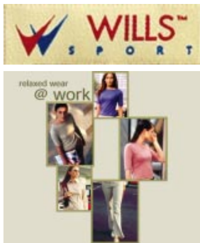
Wills Sport, the latest name in fashion wear now being promoted in India.

products. It had stated in its invitation to the meeting that the Mongolian parliament was one of the organisers of the event. "However, they did not receive official permission from the Mongolian parliament to do this. One of the ways that this company, which has lost customers in countries that have strong laws against tobacco, has tried to hook children, young people, and women on smoking is by violating the laws and regulations of the independent country of Mongolia by using the name of its supreme law making organ, the Mongolian parliament. The Philip Morris Company must bear the responsibility for the negative consequences incurred by using the name of the parliament". If only . . .