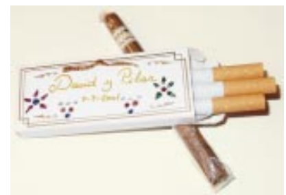
Tobacco is such a part of Spanish wedding tradition that cigarette gift boxes, inscribed with the names of the bride and groom, are often handed out to guests.

But at the celebratory wedding meal, what was in the traditional baskets of personalised gifts brought round from table to table by the happy couple, and handed to all the guests? Boxes, beautifully hand decorated with hearts and flowers and the names of the bride and groom, containing cigarettes for all the women, and cigars for the men. So much is tobacco a part of Spanish wedding tradition that cigarette gift boxes ready for decoration are to be found in