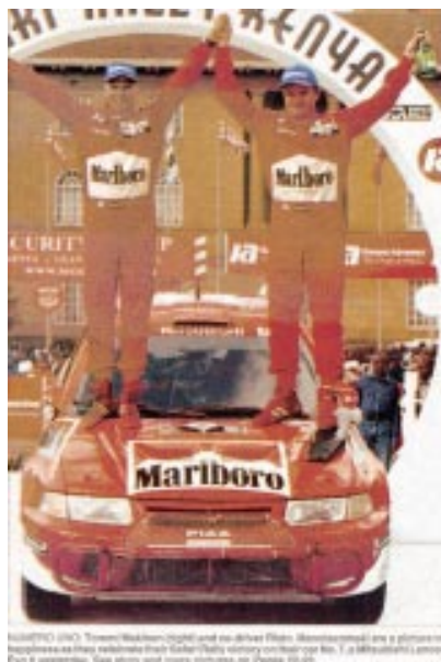
Motor sports, such as the Kenyan Safari Rally, still provide massive publicity for tobacco companies such as Philip Morris (Marlboro), who took over sponsorship of the rally from BAT (555).