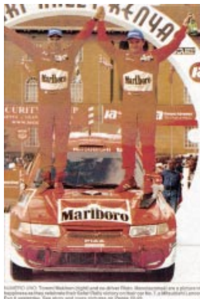
Motor sports, such as the Kenyan Safari Rally, still provide massive publicity for tobacco companies such as Philip Morris (Marlboro), who took over sponsorship of the rally from BAT (555).

the event became known as the Marlboro Rally. However, in the 1990s protests by health organisations brought about changes in the name of the event and the sponsorship arrangement—but not in the saturation coverage associating Marlboro cigarettes with courage, excitement, vitality, and success.