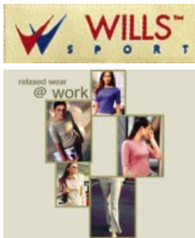
Wills Sport, the latest name in fashion wear now being promoted in India.

products. It had stated in its invitation to the meeting that the Mongolian parliament was one of the organisers of the event. “However, they did not receive official permission from the Mongolian parliament to do this. One of the ways that this company, which has lost customers in countries that have strong laws against tobacco, has tried to hook children, young people, and women on smoking is by violating the laws and regulations of the independent country of Mongolia by using the name of its supreme law making organ, the Mongolian parliament. The Philip Morris Company must bear the responsibility for the negative consequences incurred by using the name of the parliament”. If only . . .