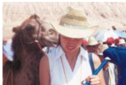
Marlboro advertising, this time on hats, manages to appear in the most remote parts of the world.

The smoking rates in China have not decreased in the last 20 years and the population increases during this period means that there are now more smokers. It is disappointing that the