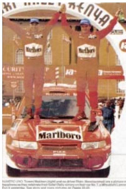
Motor sports, such as the Kenyan Safari Rally, still provide massive publicity for tobacco companies such as Philip Morris (Marlboro), who took over sponsorship of the rally from BAT (555).

the event became known as the Marlboro Rally. However, in the 1990s protests by health organisations brought about changes in the name of the event and the sponsorship arrangement—but not in the saturation coverage associating Marlboro cigarettes with courage, excitement, vitality, and success.