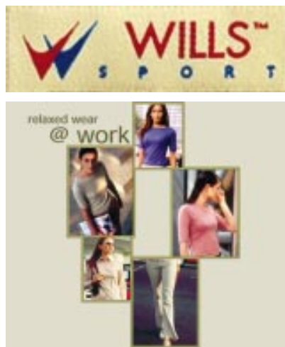
Wills Sport, the latest name in fashion wear now being promoted in India.

products. It had stated in its invitation to the meeting that the Mongolian parliament was one of the organisers of the event. "However, they did not receive official permission from the Mongolian parliament to do this. One of the ways that this company, which has lost customers in countries that have strong laws against tobacco, has tried to hook children, young people, and women on smoking is by violating the laws and regulations of the independent country of Mongolia by using the name of its supreme law making organ, the Mongolian parliament. The Philip Morris Company must bear the responsibility for the negative consequences incurred by using the name of the parliament". If only . . .