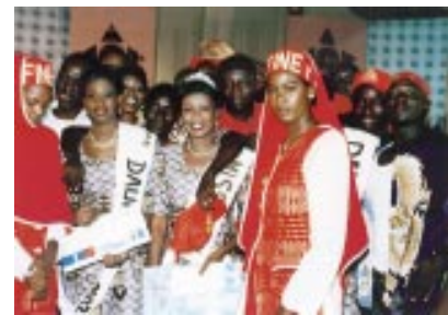
The Miss Niger beauty contest is also sponsored by Fine.

Traditional wrestling, the most popular sport in Niger, is sponsored by Fine cigarettes, which are manufactured by Seita/Altadis.