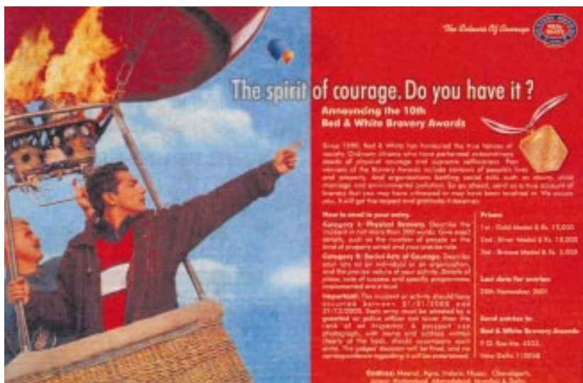
Red and White cigarette ads disguised as advertisements for a national bravery award.

In South Africa, Rembrandt, now subsumed into BAT, used a surf rescue helicopter with a huge assortment of ground backup vehicles, all plastered with its John Rolfe cigarette brand identifiers, to capture the attention of child-rich crowds at seaside holiday resorts, until it was grounded by the country's new tobacco control legislation ( Tobacco Control 1998;7:9 and 1999;8:363-4). Earlier, Rothmans had used a similar device in New Zealand