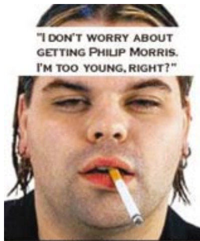
As part of its rebranding effort, lung cancer will place posters like this in doctor's offices.

An ersatz poster spoofing the name change of Philip Morris.