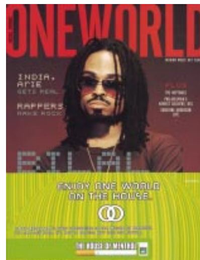
One World magazine mail shot, targeted at African Americans and other ethnic minorities, with a special wrapper promoting Kool cigarettes, plus five pages of B&W advertisements.