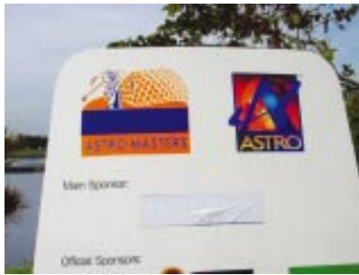
A banner at a Bangkok golf tournament, with the name and logo of Mild Seven covered over.

logo of Mild Seven, the main sponsor. While unable to prosecute the organisers, the officials had the satisfaction of knowing that Japan Tobacco may have learned how serious Thailand is about enforcing its law.