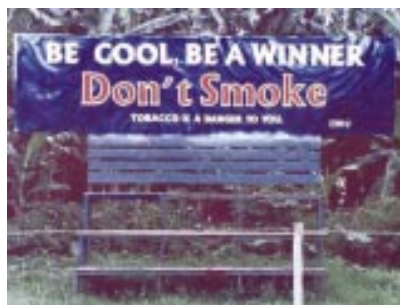
The first anti-tobacco billboard at a sports ground in East Africa was unveiled at the Kampala Rugby Football Club in Uganda last year.

East Africa was unveiled at the Kampala Rugby Football Club last year. It resulted from a Ush2 000 000 (US$1250) sponsorship package for the Kobs Rugby Football Club put together by The Environmental Action Network (TEAN), a group of young Ugandan lawyers, and Kampala's Bon Appetit Restaurant. A particularly pleasing irony is that the same billboard was previously used by BAT for Embassy cigarette ads. Kobs is a leading rugby team that draws its players from secondary schools, and the sponsorship package stipulates that the players will wear No Smoking logos on the leg of their shorts, and will sign a no smoking pledge to keep their game smoke-free. There are also plans to play recordings of health warnings against tobacco during Kobs games.