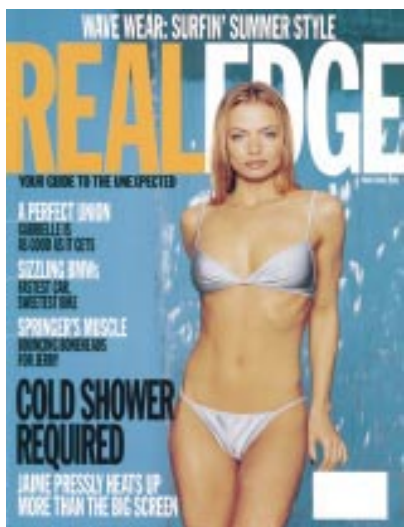
Cover of a recent edition of Real Edge , a "lad's" magazine mail shot financed by BAT's US subsidiary Brown & Williamson.

Next through the catflap came One World , an independent publication aimed at African Americans and other ethnic minorities (our informant's breed and fur-type are not known), in which B&W had bought a generous five full pages of advertising space, topping off a bulk purchase for its