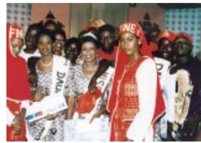
The Miss Niger beauty contest is also sponsored by Fine.

Traditional wrestling, the most popular sport in Niger, is sponsored by Fine cigarettes, which are manufactured by Seita/Altadis.